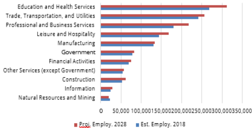
Source: TDLWD, WIR 2 ED Division, Middle Region Long Term Projections 2018-2028, and TN Middle Region Occupational Employment and Wages Survey (OEWS) 2020

For a focus on growing and mature sectors, private, rather than public sector employment, and middle-skill jobs with self-sufficient wages, the Regional Planning Council (RPC) and partners have identified the top in-demand sectors, industries, and occupations, in order of priority based on current size and then growth of the sector in the region per the graph below from the Middle Tennessee Economy Growth 2020-2021 Reference Guide Figure 22: