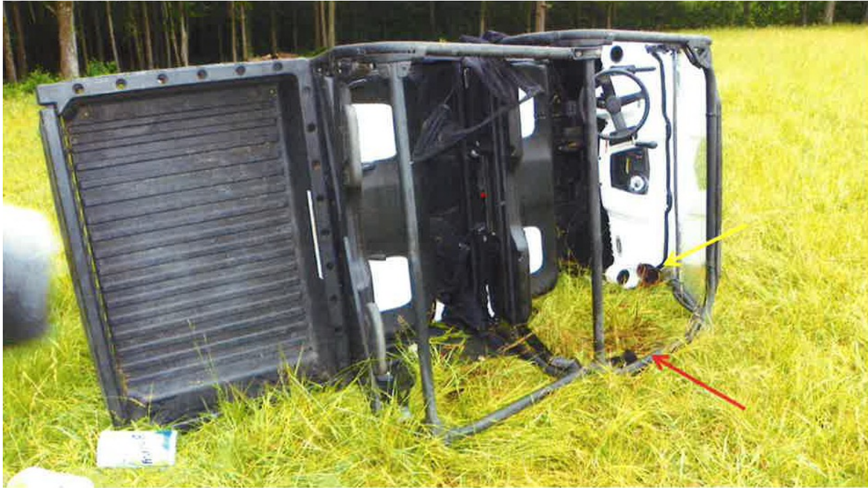
Photo 1 of 2 – Photograph showing the Polaris resting on the passenger side.