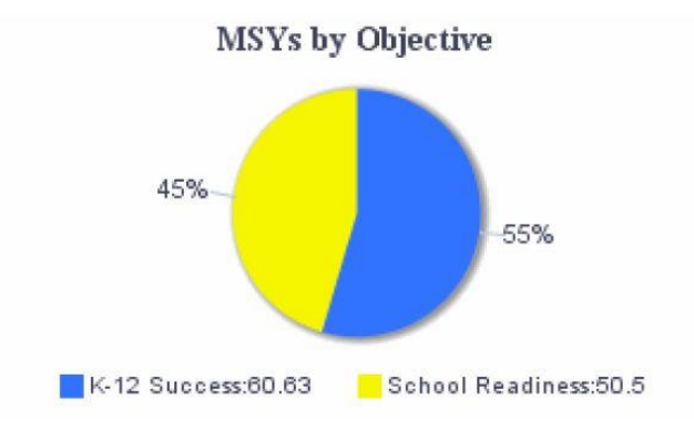
Table2: MSYs by Objectives

Table 2 and its corresponding pie chart show the same MSY information expressed as percentages of the total MSYs: