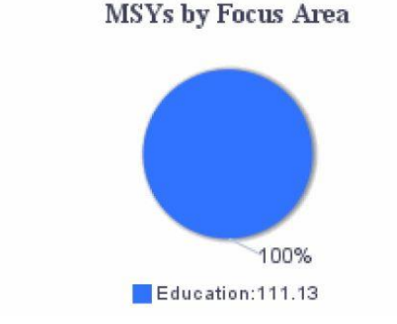
Table 1 and its corresponding pie chart show the total number of MSYs by Focus Area. Since both the K-12 Success and School Readiness objectives are in the Education Focus Area, Table 1 shows 100% of MSYs in Education.