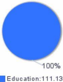
Table1: MSYs by Focus Areas