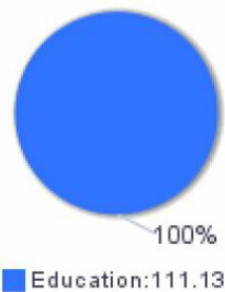
Table 1: MSYs by Focus Areas