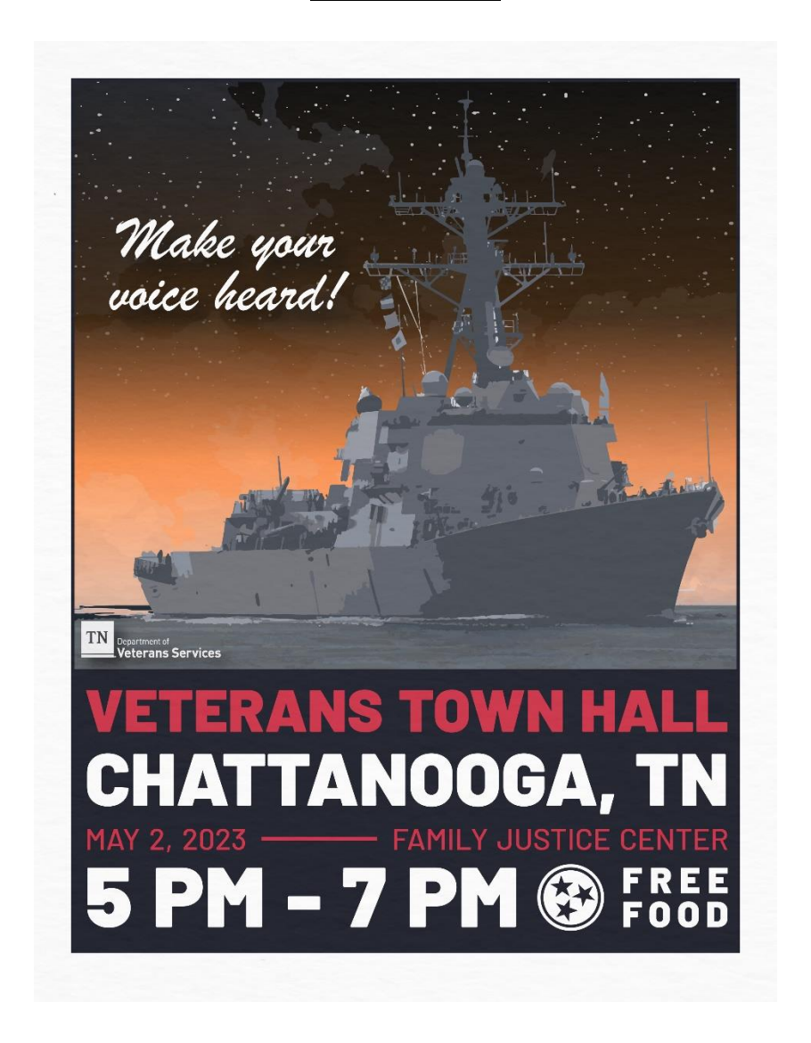
TDVS Town Hall