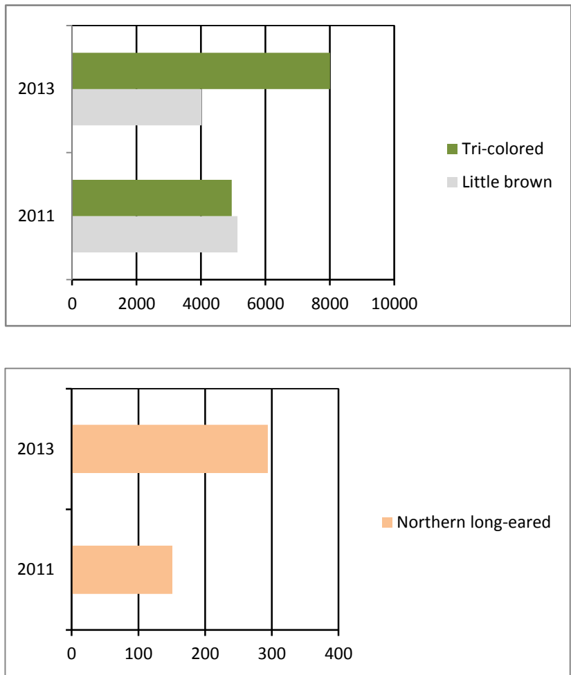
Figure 4. Comparison between 2011 and 2013 bat hibernacula surveys for tri-colored (34 caves), little brown (24 caves), and northern long-eared bat (17 caves). Some caves were not surveyed in 2011 in those cases data is from 2012.