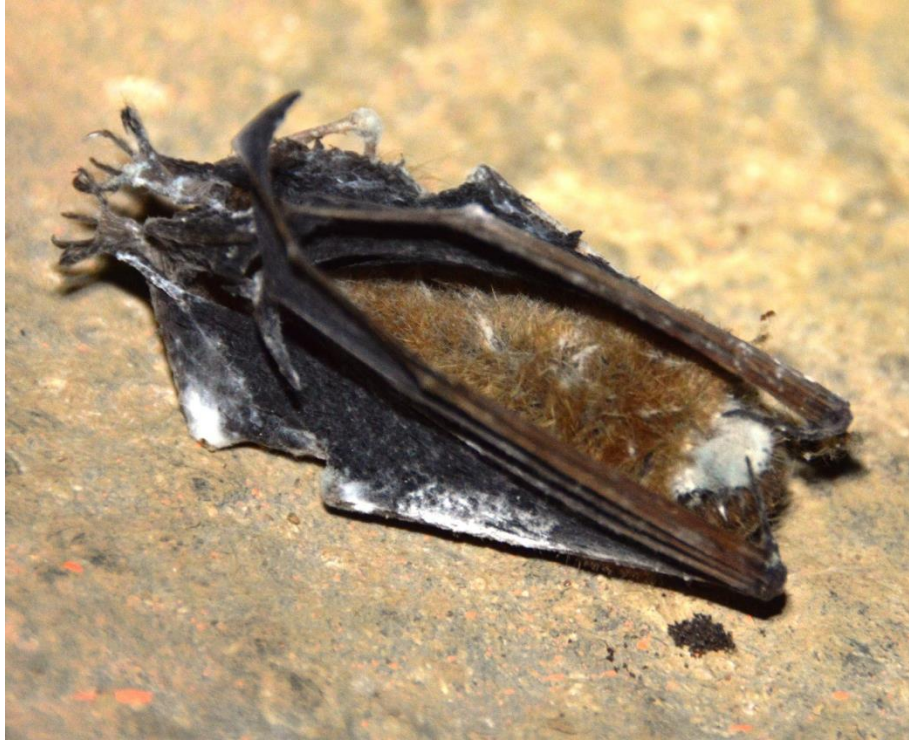
Figure 5. Dead tri-colored bat on cave floor Cannon County.