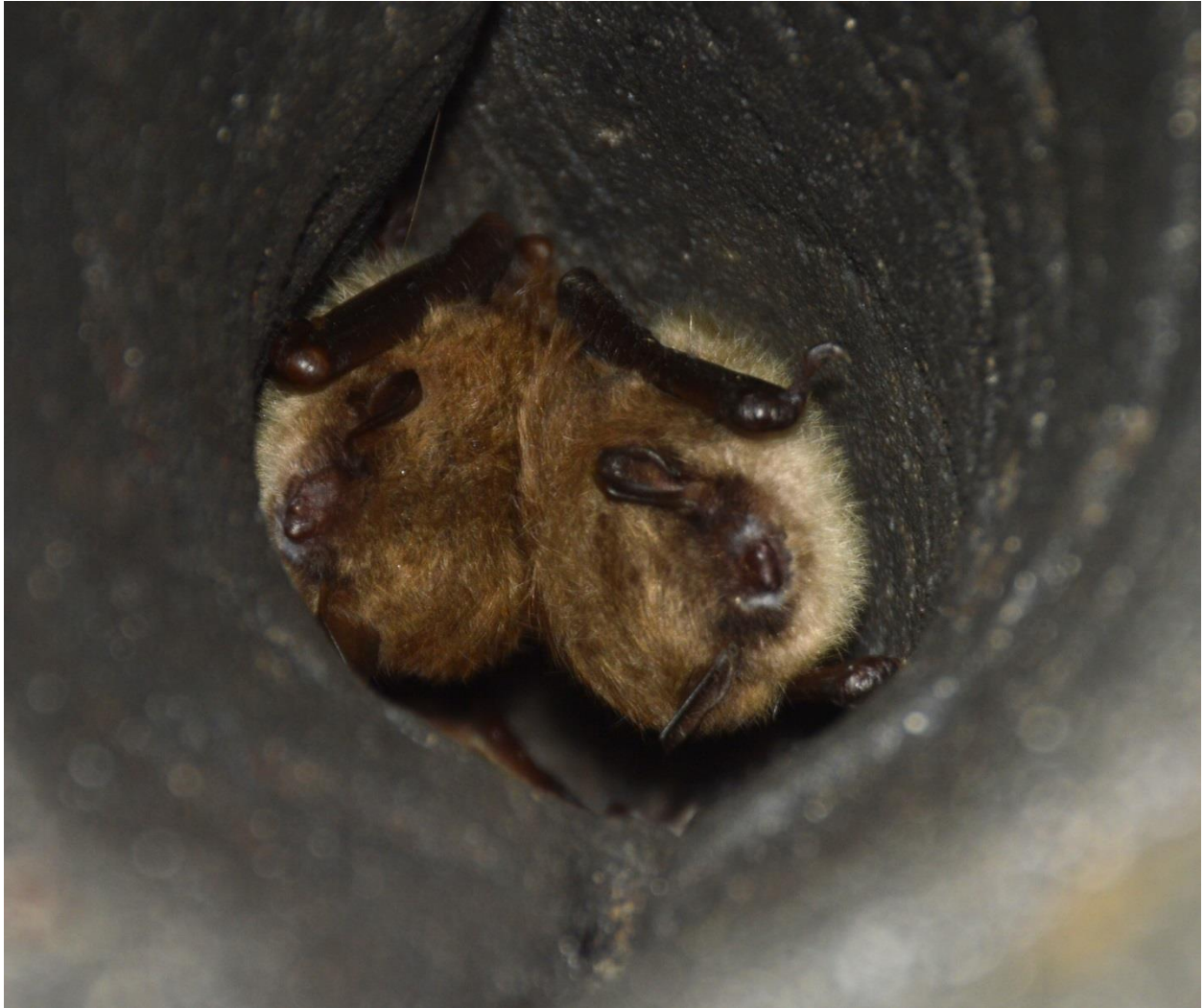
Little brown bats with potential white nose syndrome, New Mammoth Cave, Campbell County, TN, Cory Holiday (TNC)