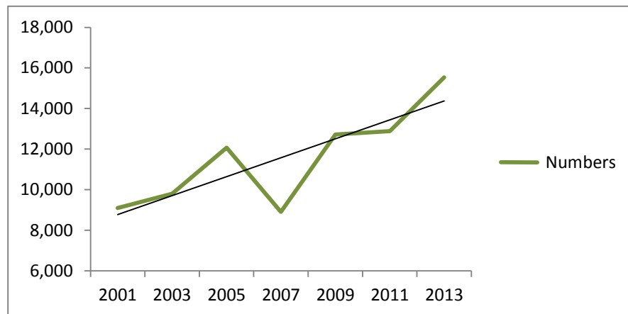
Figure 3. Indiana bat count from known hibernacula with positive trend line (2001 to 2013). 2013 data corrected using U.S. Fish and Wildlife Service estimates.