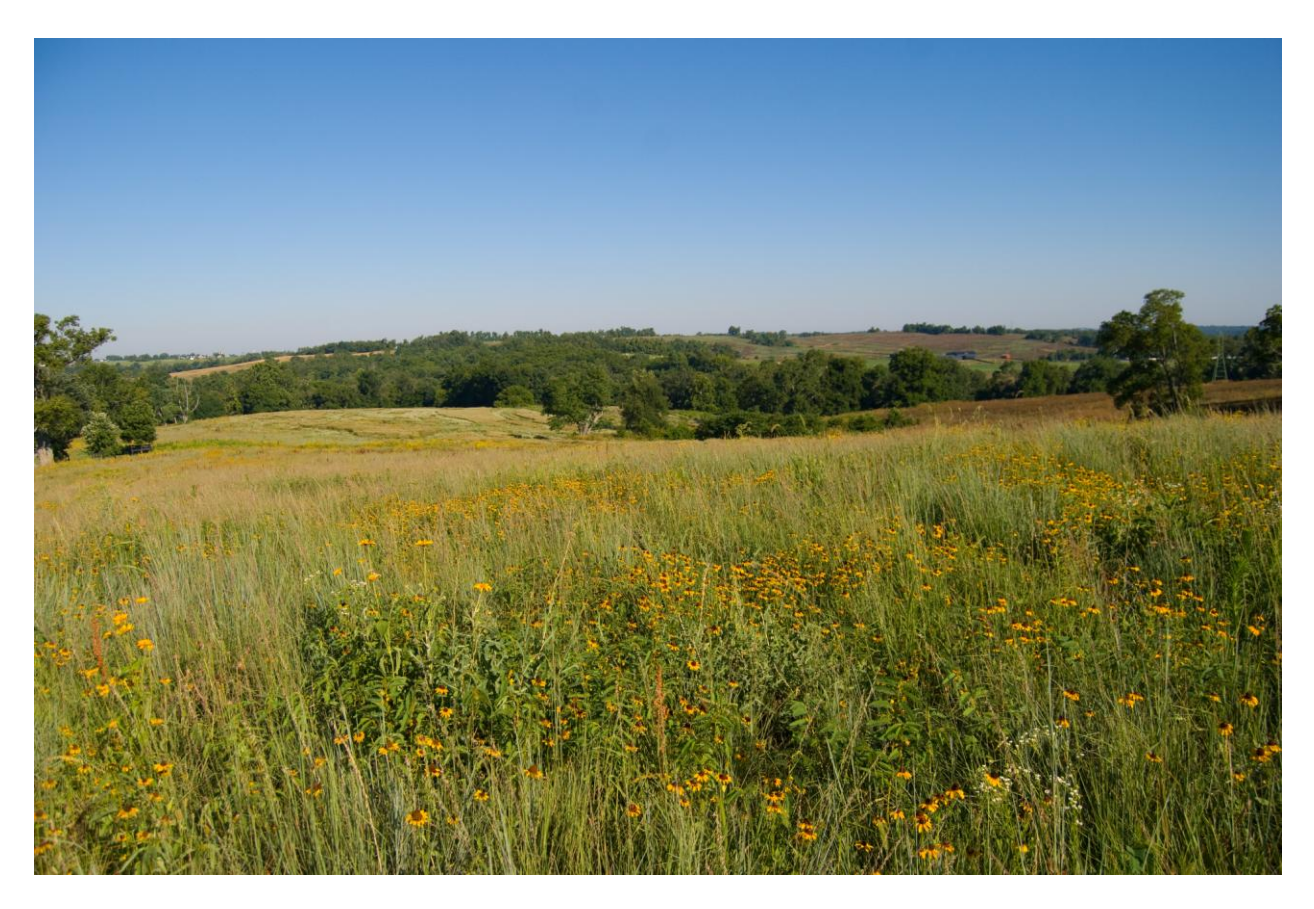
Lighter seeding allows greater forb diversity

Light seeding rates (3 to 5 PLS pounds of seed per acre) are preferred over traditional, heavy native grass seeding rates (8 to 12 PLS pounds of seed per acre). Lighter rates provide more room for native wildflowers, legumes and annual seedy plants such as ragweed and croton. Shorter native grasses such as little bluestem and broomsedge are preferred over taller native grasses such as big bluestem, Indian grass and switchgrass for a variety of reasons. "Shorter" native grasses and low seeding rates provide better habitat structure (the interspersion of nesting and brood-rearing cover together) and they may require less frequent disturbances from prescribed fire or strip disking than sites established with "taller" grasses at heavy seeding rates. Establishing a diverse mix of native wildflowers and/or legumes improves plant diversity, thereby attracting more insects and creating better habitat structure. Below are some suggested native grasses and wildflower seeding rates for Midwest field borders. Species and rates can vary a great deal across the bobwhite's range, so consult local experts on what is best in your area. Heavy seeding rates may be required on other buffer practices.