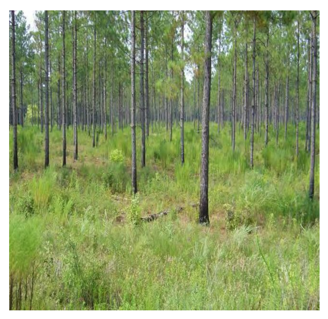
Thinned & Burned, 60-80 ft<sup>2</sup> basal area

This is an acceptable timber stocking for deer, turkeys and other habitat generalists. The increased sunlight coupled with frequent burning results in improved ground cover structure and composition, providing nesting and brooding cover for turkeys and quality forage and fawning cover for deer. Gaps in ground cover are still predominant, which makes bobwhites vulnerable to predation especially during winter months. Ground cover will decrease as tree canopy quickly closes and reduces sunlight with the end result being limited value to bobwhites.