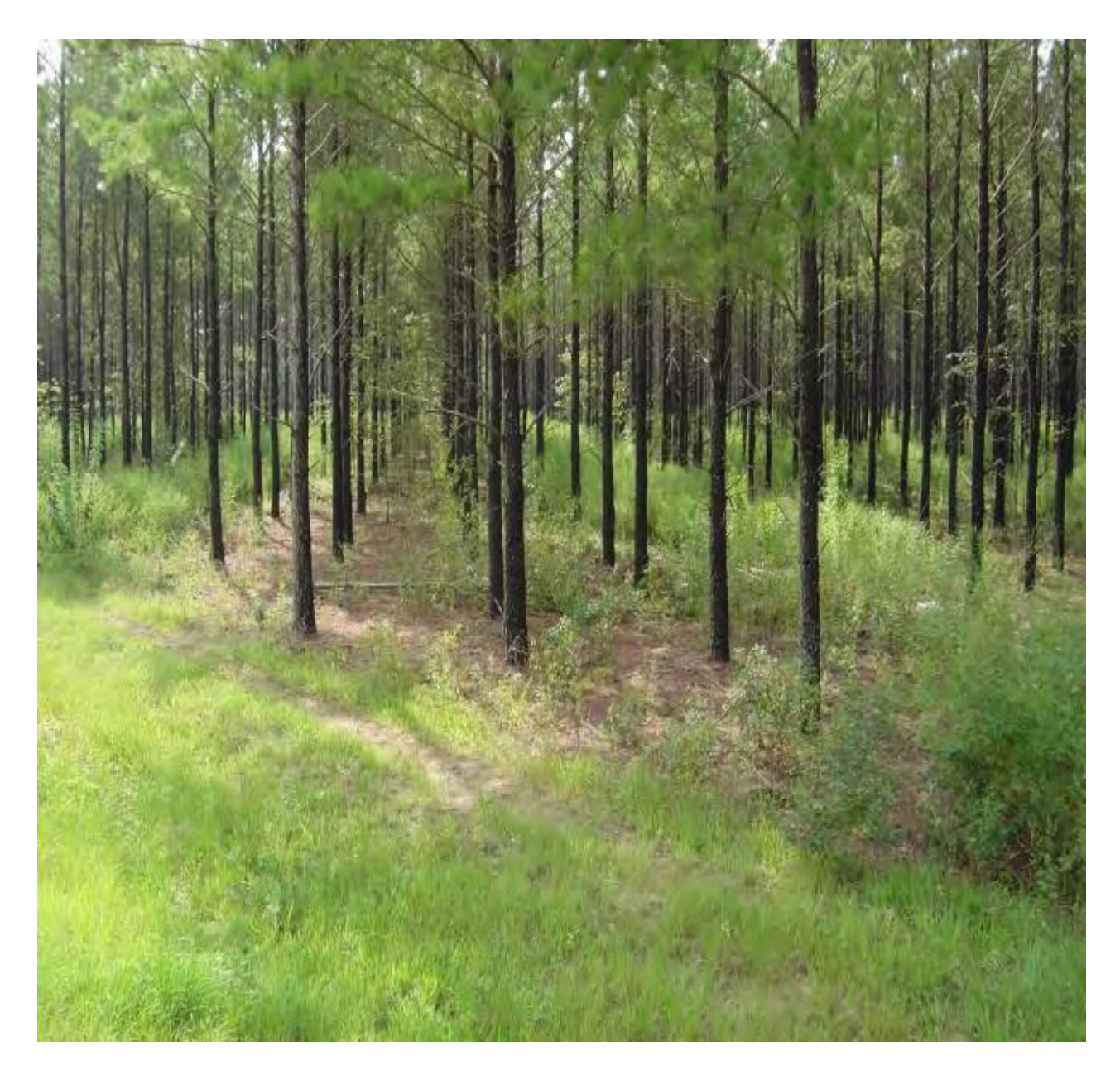
Thinned & Burned, 80-100 ft<sup>2</sup> basal area

Typical results of 5th-row thinning when timber management is the main objective. Increased sunlight penetration in take-out rows allows for increased ground cover but ground cover is too thin between other rows, which decreases food and cover and increases vulnerability to predation. Burning this stand results in some wildlife benefits but more sunlight is needed produce and sustain quality ground cover. A heavy within-row selection of trees will be needed in the next thinning to restore and sustain ground cover