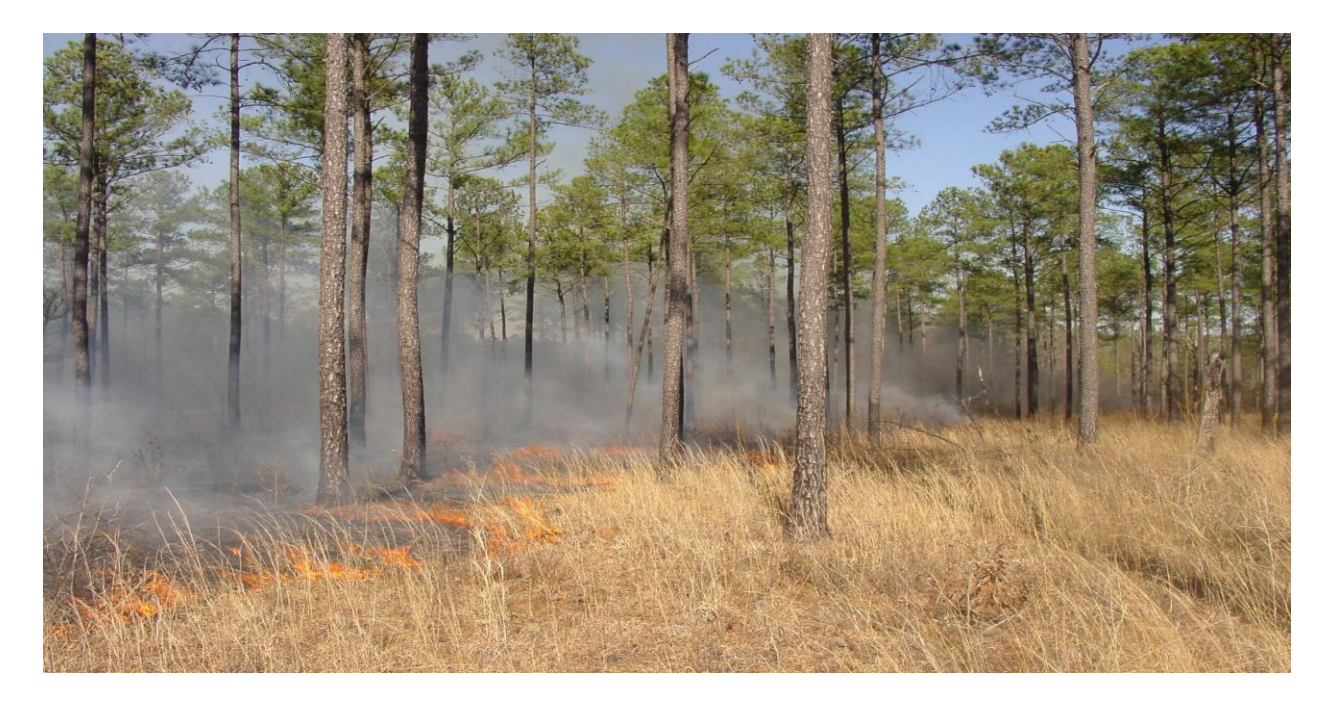
Frequent burns are essential in pine forests

Prescribed Burning – Frequent prescribed burns are essential in pine forests to control hardwood sprouts and encourage desirable native grasses, legumes, forbs and shrubs used by quail. Land managers should apply fire to a portion of pine woodlands annually to maintain suitable cover for quail. Mowing of invasive hardwoods immediately following burns and/or selective herbicide applications is often necessary for adequate control of undesirable vegetation. Whenever possible, land managers should use herbicides that minimize damage to desirable native grasses, forbs and shrubs. Across sites of moderate to high fertility prescribed fire should be applied on a 2 year frequency where 50% of the burnable woods are burned each year. On very infertile sites and especially during drought years a 3 year burn frequency may be sufficient. If left unchecked, hardwood sprouts can quickly shade out desirable plants, and will often require mechanical and chemical treatments once in the mid or overstory.