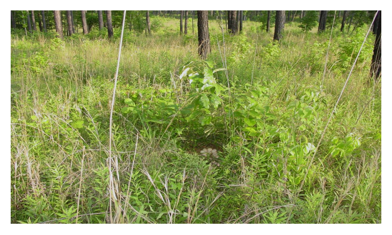
Turkey nest in pine forest with 2 year fire rotation

Care should be taken to leave desired nesting cover each year. Generally, prescribed burn units should be less than 60 acres in size; however, good quail habitat can be maintained in larger burn units (up to 80 acres) if undisturbed upland sites (1 to 5 acres in size) are maintained and well distributed throughout the burn unit. Ideally, 25 to 50% of the site should provide quality nesting cover. This can be accomplished by placing firelines around desired habitat patches within a burn unit. Some managers refer to these as "ring-arounds." Ring-arounds may also be used to maintain good patches of shrubby cover in small 50' by 50' foot "covey headquarters" areas distributed evenly within burn units. If you can picture a checker board, envision 1 in 5 of the squares, spread evenly through an area, maintained in good shrubby cover, 2 of 5 squares in good nesting cover, and 2 of 5 squares in good brood rearing cover, whether within woodlands, or in open land settings.