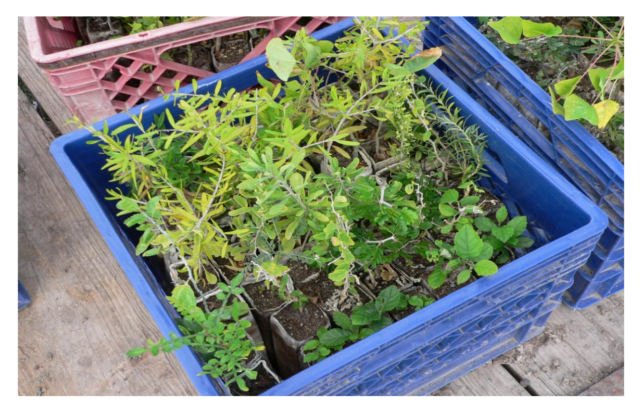
Assorted native shrubs in planting tubes

area should be felled, making sure native shrubs are left undisturbed. An occasional tree may be left to preserve valuable timber or mast producing species. Generally, treat all cut stumps with an approved herbicide to prolong the benefits of edge feathering. If possible, leave felled trees where they fall. Edge feathered trees may be dropped parallel to the fence line/field edge or cut and loosely stacked along the edge of the field. Do not push the downed trees into a dense brush pile. Edge feathering may be completed with a chainsaw or mechanical clipper.