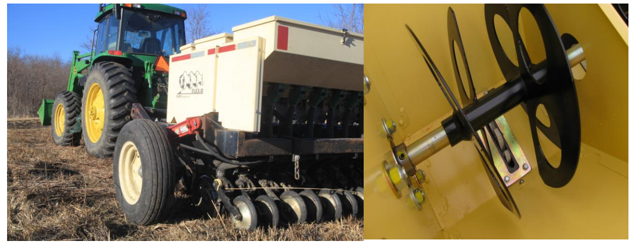
A special planter, often with multiple seed boxes and an agitator that allows the use of fluffy seeds, is needed for planting many native grasses and forbs

Native grasses and wildflowers may be established during the dormant season or spring. The light, fluffy seeds will require special seeding equipment or unique seeding methods such as the winter planting shown in Scott James', Quail Forever photo below to effectively distribute the seed across the field. Good results can be expected when seeds are broadcast or planted with a no-till drill if proper seedbed preparation and adequate rainfall occur. Newly established native grass and wildflower plantings should be periodically mowed to a height of 6 to 10 inches during the first year to reduce weed competition and promote their growth. Warning: Mowing should not be used as a long-term management practices as mowing does not create favorable habitat conditions and plant structure for quail. Selective herbicides can help reduce weed competition and thereby reduce stand establishment. Warning: Imazapyr can damage some native grasses and wildflowers. A good stand can be expected by the 2, 3 or 4 growing season depending on weed control measures, site conditions and climate.