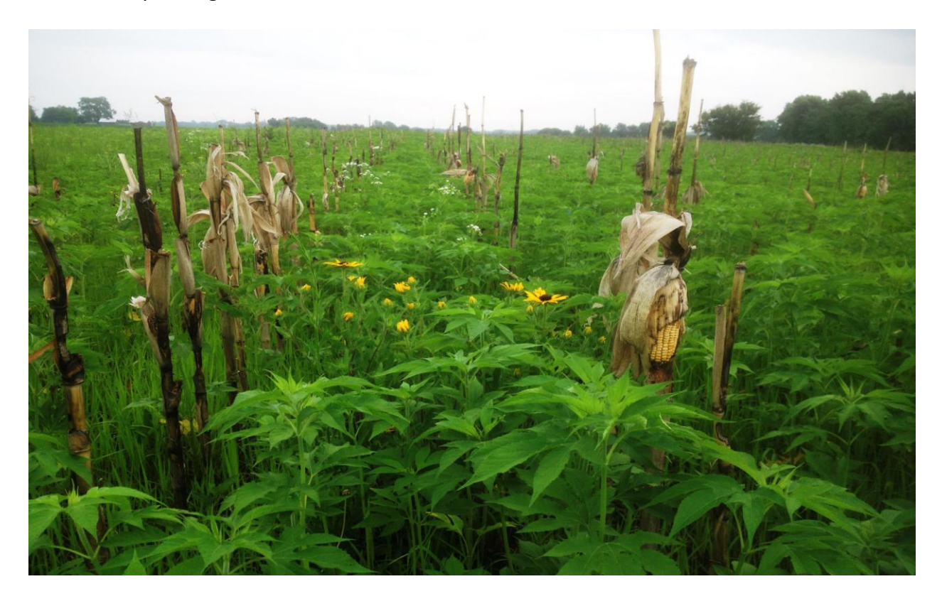
Previous year's food plot with excellent brood habitat – photo by Stan McTaggart ILDNR

improved for by eradicating all existing vegetation, including native grasses and wildflowers. Native grasses and wildflowers can be reestablished once the invasive vegetation has been eradicated. To prevent future reinfestations, land managers are encouraged to spray areas adjacent to the field border and underneath trees and shrubs. Use of a boomless sprayer is an effective way to target invasives in these areas.