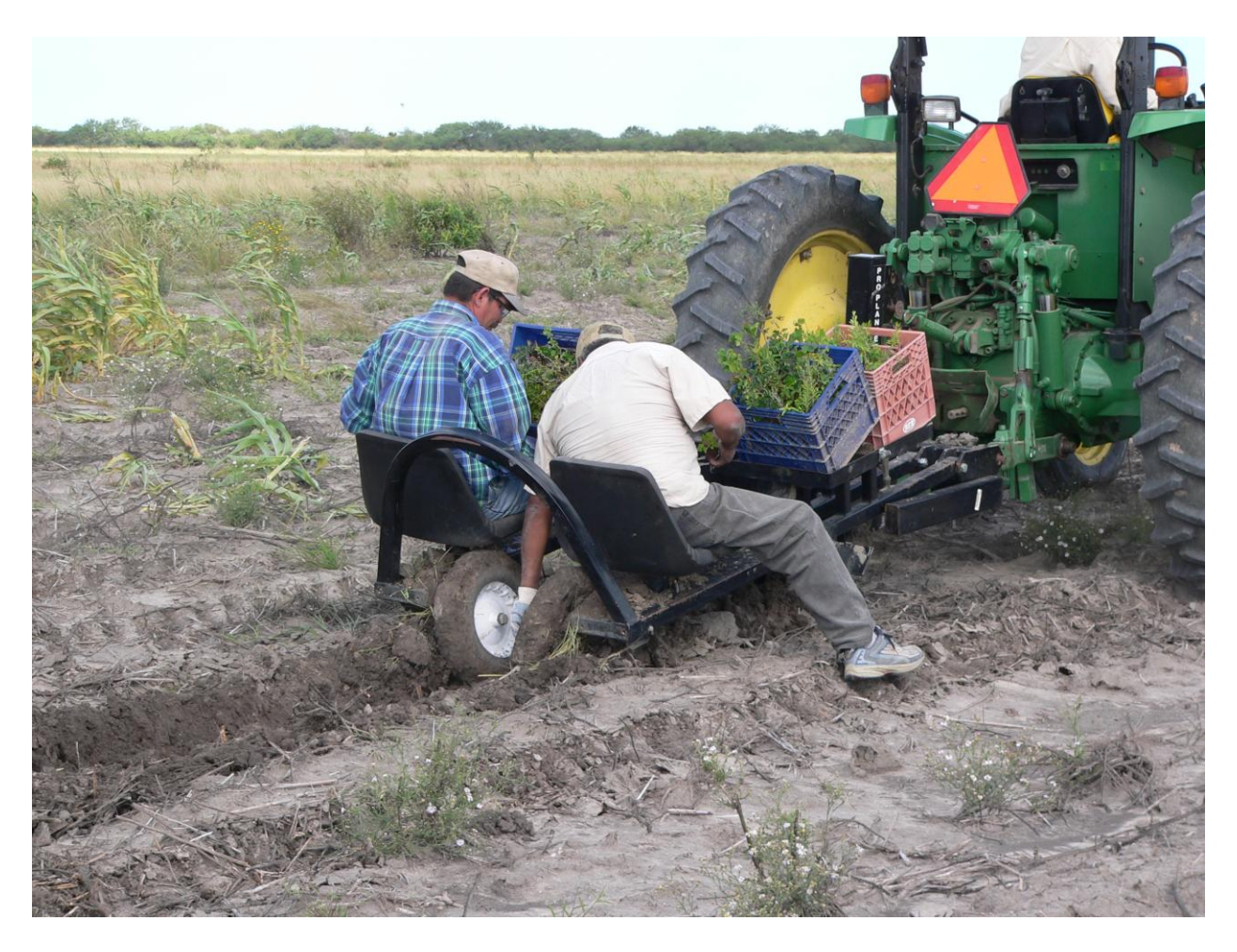
Native shrub planting in a recently farmed field

or cut and loosely stacked along the edge of the field. Do not push the downed trees into a dense brush pile. Edge feathering may be completed with a chainsaw or mechanical clipper.