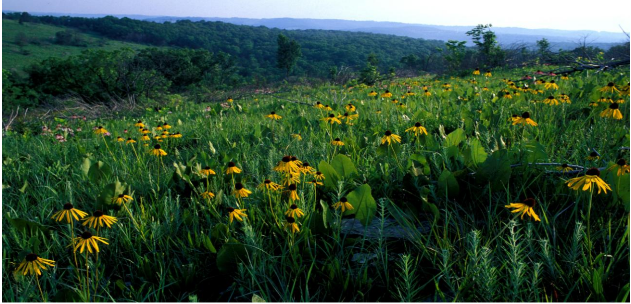
Wildflower glade on a south facing slope above and rocky glade below – photos from MDC

to restore and maintain woodland. Prescribed burning will promote herbaceous plants for nesting and brood-rearing cover and control excessive woody growth. Some use of herbicides may be required to adequately control hard wood stump / root sprouts and maximize the effectiveness of subsequent prescribed burning.