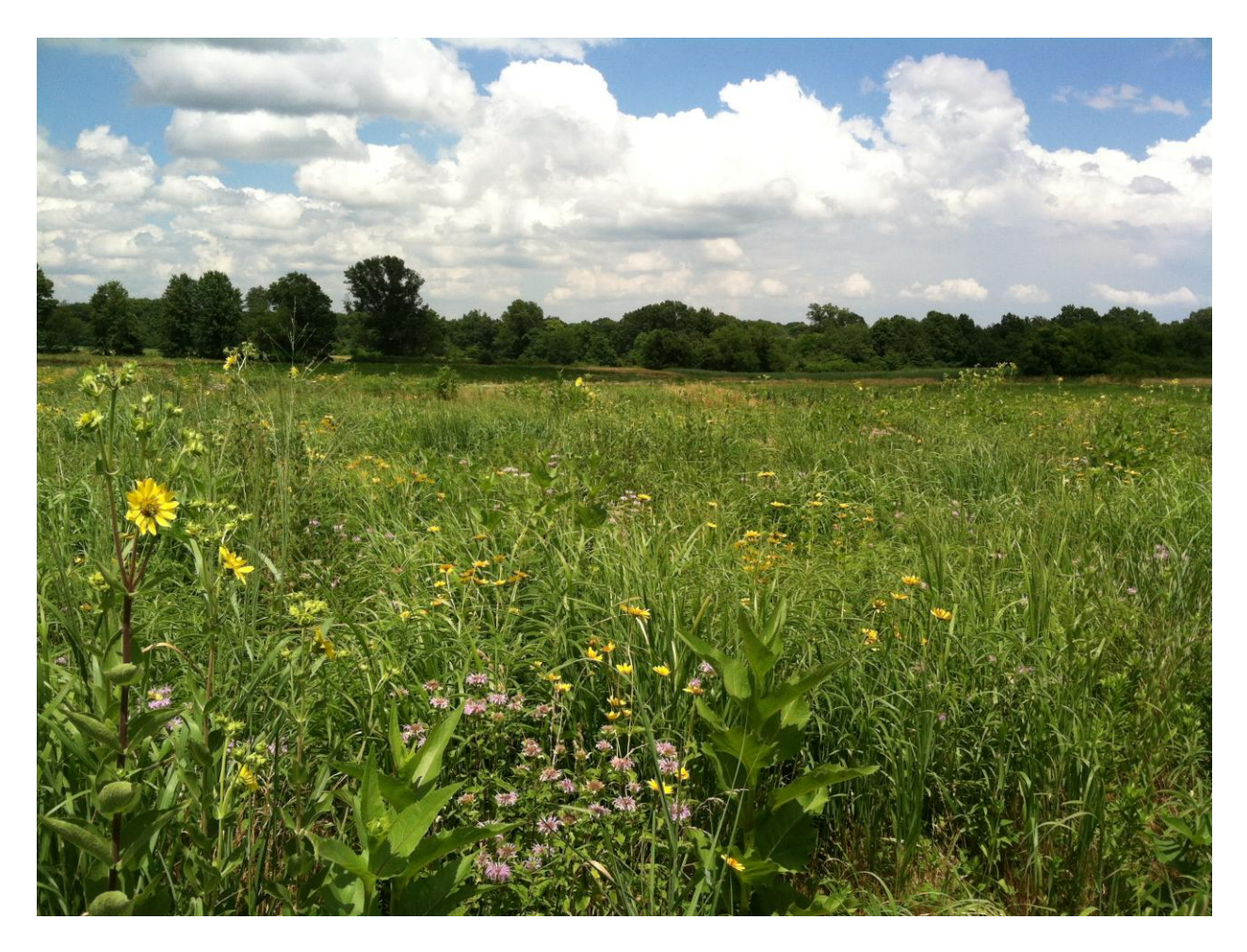
Interseeding can increase diversity - photo by Chris McLeland, MDC

In hay pastures consider delaying harvest until early summer to avoid destroying quail nests and young birds. Land managers interested in enhancing quail numbers should refrain from haying corners and odd areas; leave large blocks or a 30 to 120 foot wide unharvested border around the edge of the field.