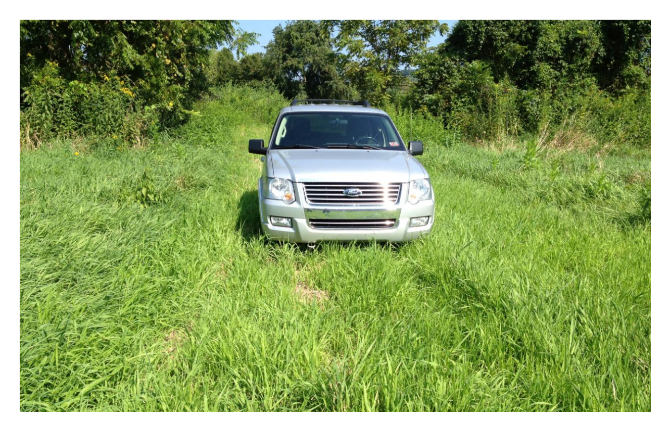
Site invaded by reed canary grass

Livestock Exclusion – Protect idle areas, woodlots, woody draws and food patches from heavy or continuous livestock grazing. Allowing desirable native grasses, forbs and shrubs to develop can provide good nesting, brood-rearing and protective loafing cover along the edges of pastures and hayfields.