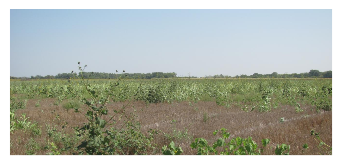
Midwest fallow wheat field with good food and cover for quail

Fallowing – Land managers should consider idling field edges or whole fields for one to five years to provide high quality cover. Fallowing fields is an effective and economical way to provide high quality cover at little or no cost. Idle field borders should be at least 30 feet wide and preferably 60 to 180 feet wide. In most cases idle areas should be allowed to revegetate in annual plants; however a light seeding of annual lespedeza or alfalfa can improve brood-rearing habitat. Land mangers interested in maximizing quail habitat should periodically fallow entire crop fields. Fallow field borders and crop fields should be periodically farmed to setback plant succession. To be more effective, fallow areas should be adjacent to shrubby cover.