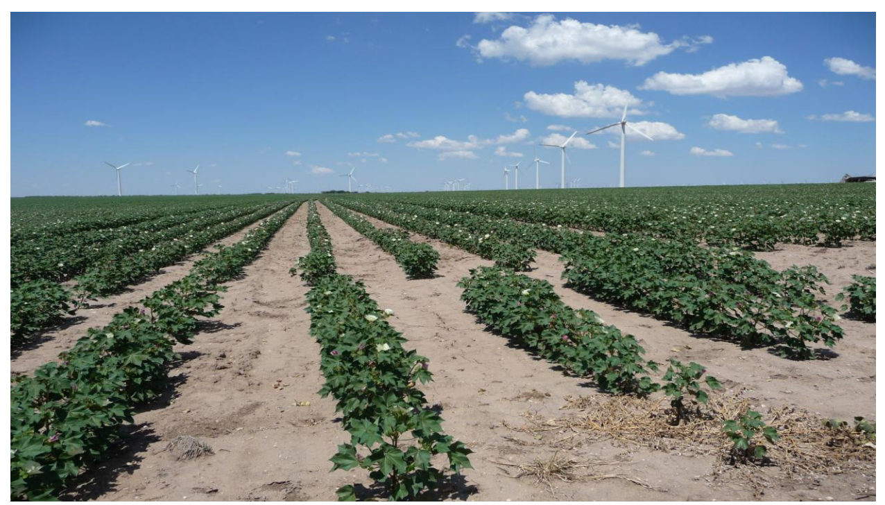
Modern clean farming eliminates nesting and brood habitat

Agricultural Lands - Increase the amount and enhance the quality of nesting, brood-rearing, escape and roosting cover for bobwhites and other grassland wildlife on agricultural lands, through the establishment and/or management of native warm-season grasses, forbs and shrubs.