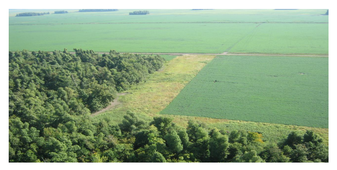
Using native buffers near woods reduce competition with crops

circumstances; proper seedbed preparation, quality seed, proper planting depth, weed control and beneficial weather, native grasses can become established in one growing season. Despite good growth the first growing season, native grasses should not be hayed or grazed during Year 1, unless to achieve a very specific management objective (weed control). If they are grazed it should only be under very controlled circumstances with no more than 50% of their leaf surface area being removed. It is important during the first two growing seasons that native grasses not be over stressed by removing too much leaf surface area during the growing season, since during this time roots are developing. Roots will be fully developed by the end of the second or third growing season and normal use is acceptable at that time.