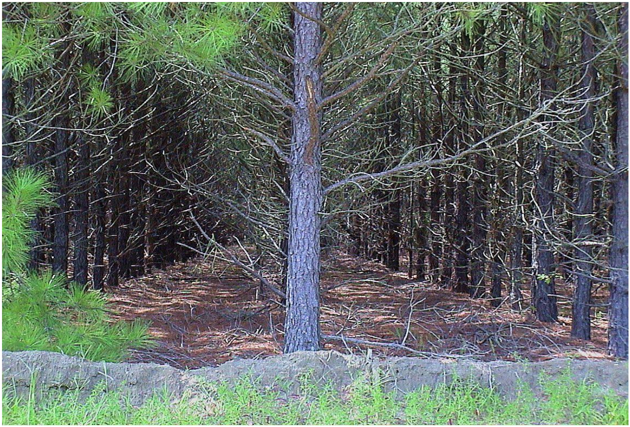
Overstocked Pine Plantation with closed canopy - photo by Billy Dukes SCDNR

Pine Forests - Enhance and increase nesting and brood-rearing habitat in pinelands and mixed pine-hardwood forests by thinning, controlled burns, site preparation and forest regeneration in a fashion that benefits bobwhites and other wildlife.