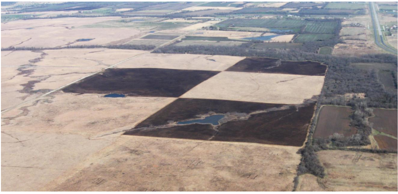
Patch Burn Grazing creates a diverse pattern of vegetation; irregular burns would allow even more diversity by creating additional edges

Another effective grazing technique is high intensity/low frequency stocking. Under this managed grazing system, animals are stocked at such a high density that nearly all the vegetation is grazed in the paddock. With this system livestock are constantly moved and may only graze a paddock 1 or 2 times per year. The results are a mix of grazed and ungrazed paddocks that provide adequate forage for livestock. The rested paddocks provide good nesting cover and after a couple weeks the heavily grazed paddocks are a mix of new grass growth, forbs, and legumes that provide good brooding cover. Because each paddock is only a few acres in size there is always a good mix of nesting cover (rested paddocks) adjacent to good brooding cover (recovering paddocks).