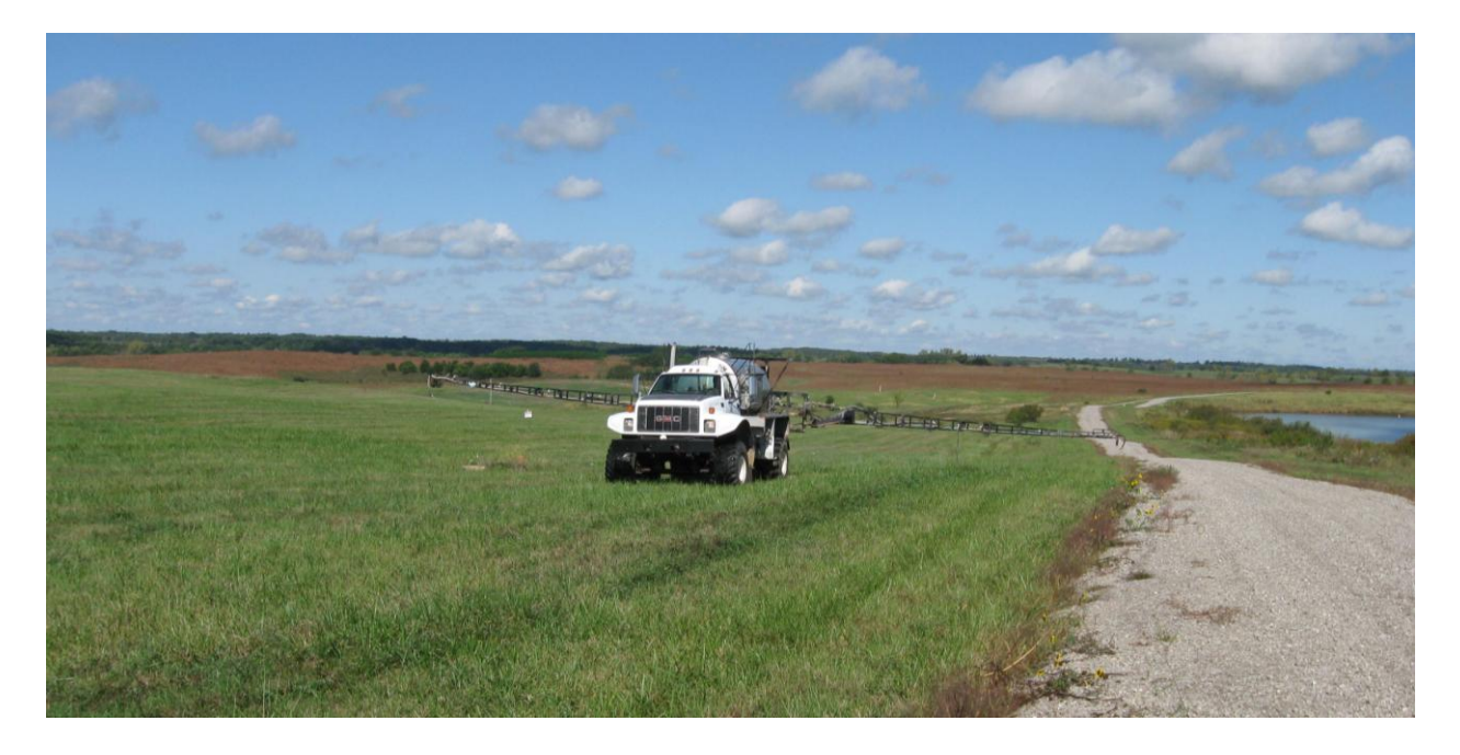
Spraying introduced grass pasture prior to reseeding with natives

The key to establishing native grasses and wildflowers is to prepare a seedbed free of plant competition. Often multiple herbicide applications are in necessary if sod forming grasses are present. Specialty herbicides such as Imazapyr or Imazapic (when used in combination with glyphosate) are effective at controlling unwanted vegetation. Land managers may want to consider farming sites for one or two years with glyphosate-resistant crops to eradicate any unwanted vegetation and to reduce costs. This method is commonly used in the Midwest for prairie reconstruction projects, with excellent results.