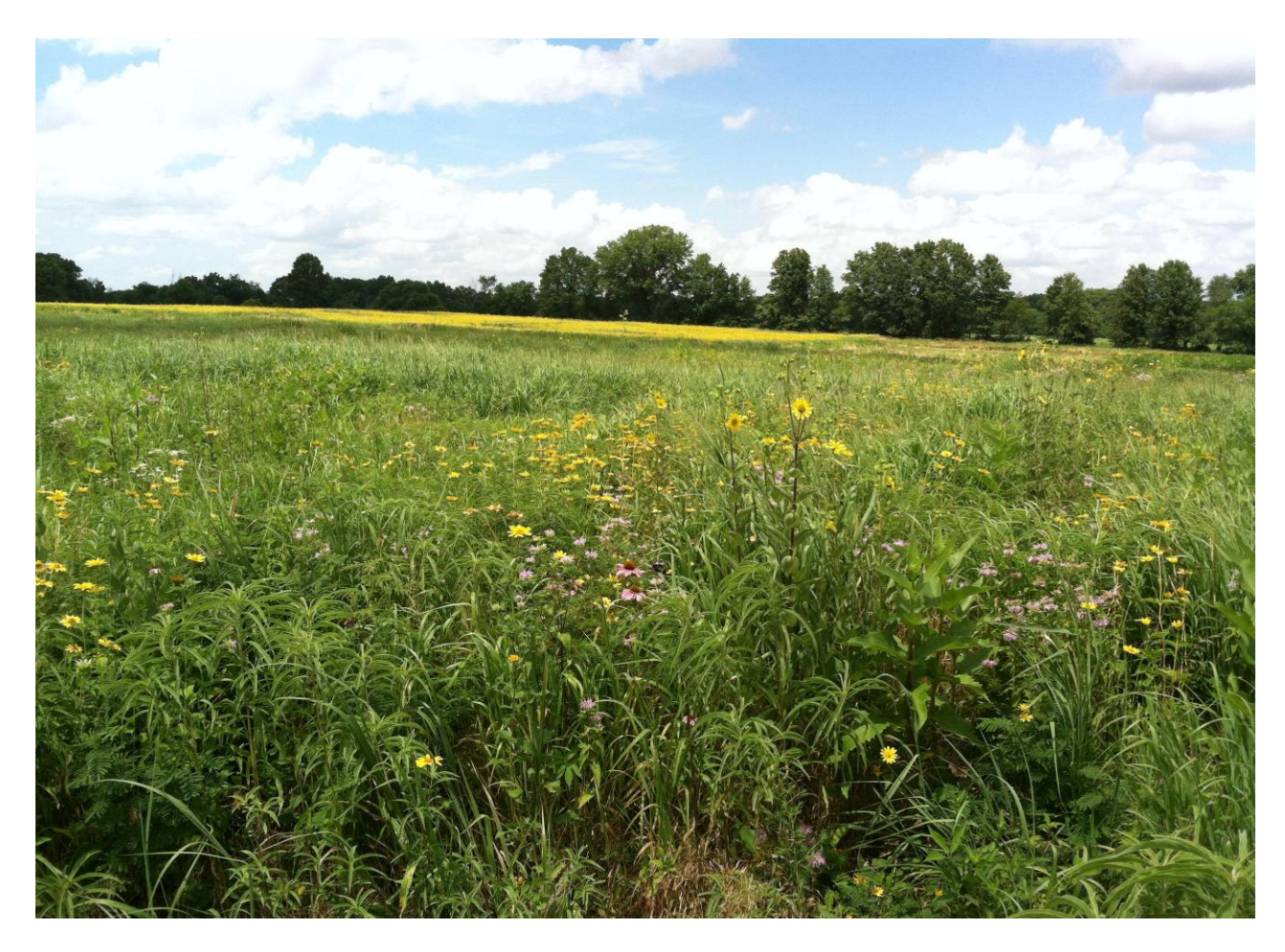
Native grass/forb biomass planting with pollinator benefits in Missouri

Where biofuels harvest will be considered, land managers should minimize annual needs for inputs (eg. fertilizer, pesticides) by selecting native grass and forb plantings. Consider planting or interseeding legumes to fix nitrogen in the soil, increase diversity in plantings, and provide pollinator habitat.