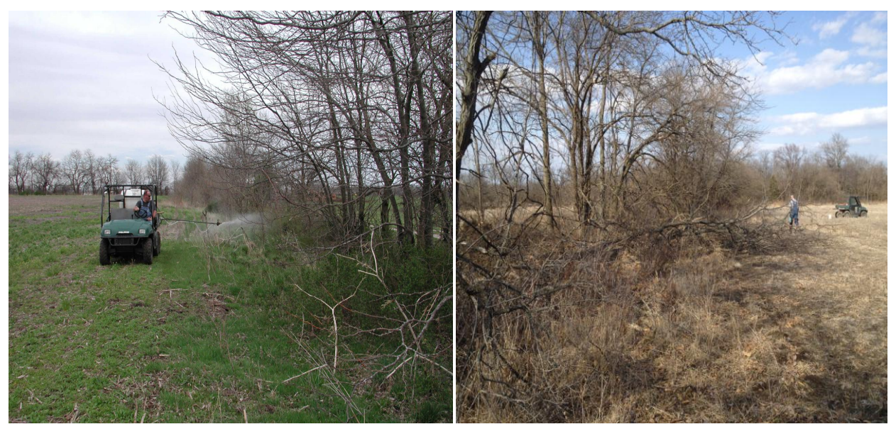
Controlling undesirable vegetation before edge feathering

Consider planting 2 or 3 rows of low-growing shrubs and adjacent native grass field borders on the outside edges of riparian buffers to improve quail habitat. Establishing contour buffer strips in crop fields through continuous CRP is an effective way to improve habitat arrangement for quail in intensive agriculture landscapes. Contour buffer strips should be 20 to 30 feet wide and established to native warm-season grasses, wildflowers and legumes. Where feasible, plant shrub thickets, or allow the development of native thickets, in or along the contour buffer strips to provide suitable protective cover.