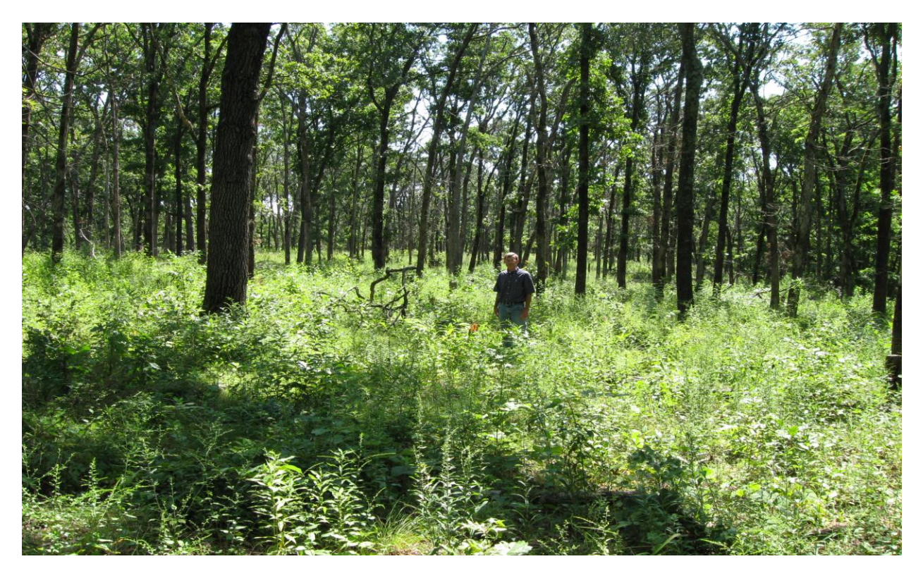
Thinned oak woodland with good light penetration

to allow 50% full sunlight at ground level at mid-day (measured when leaves are on the trees). An open overstory and a sparse midstory are critical to promote native grasses, forbs and legumes for nesting and brood-rearing cover. Combinations of these cover types also produce seed bearing plants that provide winter feeding areas.