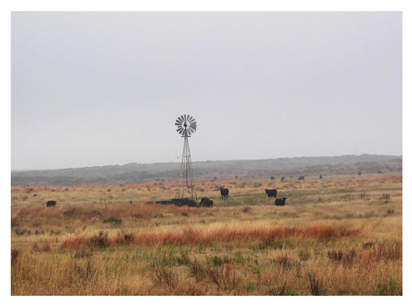
Well managed native rangeland

Land managers interested in enhancing and maintaining habitat for quail should consider conservative stocking rates, especially in areas of low annual rainfall, in order to maintain this mix of good vegetative structure. Research indicates nesting quail select areas with taller, denser grass clumps. Cattle should be deferred from rangelands when native bunchgrasses are reduced to less than 200 clumps per acre and/or are less than 8 inches tall. Grazing strategies that maintain at least 700 grass clumps/acre over 10 inches tall are ideal. On rangelands where the species composition does not currently support desired grasses for nesting cover, more intensive restoration methods may needed. These include specialized grazing management designed to restore mid and tall grasses – such as multi pasture single herd rotations (4 Pasture – 1 Herd), complete destocking of livestock for a period of time, control of invasive grasses or woody species, reseeding native grass species and brush management. If a suitable density of desired grass species exists, then a lower level of grazing management may suffice to maintain the desired density of ground cover. Periodic destocking may still be necessary to maintain desirable nesting cover depending on local conditions.