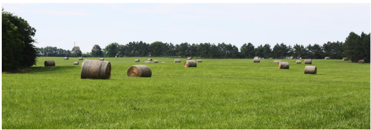
Frequently harvested fescue hay pasture - photo by Marc Puckett, VDGIF

Pastures and hay fields established to "tame" grasses such as tall fescue, smooth brome, Bermuda grass, and bahia grass provide extremely poor habitat for quail because these forages do not provide adequate structure for nesting and brood-rearing. Current intensive grazing systems using monocultures of introduced grass do not provide adequate nesting cover, plant diversity and bare ground for brood cover. –In addition, most intensive grazing systems are grazed too frequently or at too high stock density for a hen quail to nest, lay 12-15 eggs, and incubate them for 21-23 days without either being trampled by livestock <u>or</u> having all the cover removed. Another common problem is nesting cover may not be located near brooding cover – if successful, a quail may have nowhere to take a young brood after they hatch (consider what biologists learned from the radio collared quail and the fact that a day old quail chick is no bigger than a quarter). -Continuous, severely grazed pastures normally will not provide nesting or brooding cover for quail. –Introduced sod forming grasses also become too dense when rested to allow movement by quail chicks and their lack of diversity provides little in the way of the weed seeds and insects that the chicks need.