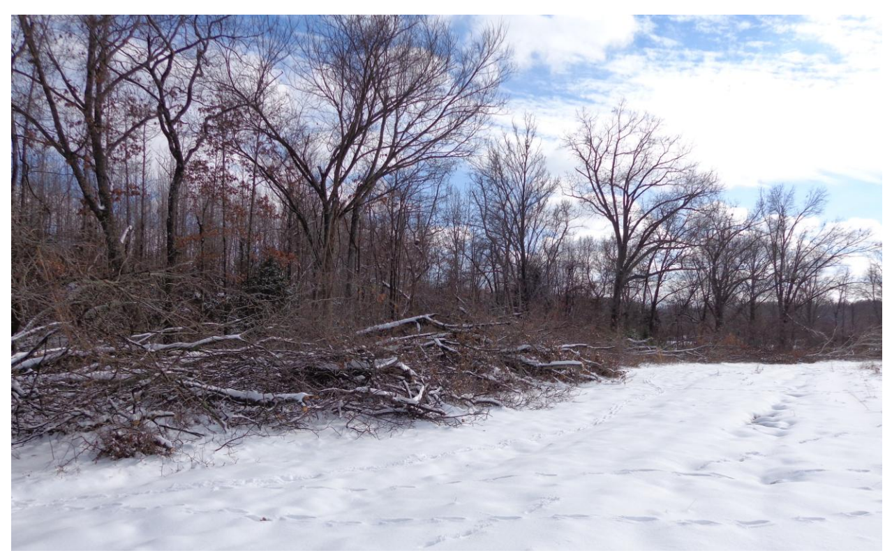
Example of edge feathering

Shrubby Cover Enhancement – During the winter, coveys will often establish a headquarters area and loafing site around one or more shrub or low-growing woody cover sites. Patches of shrubby or woody cover should be spaced 50 to 100 yards apart and at least 30 to 50 feet wide. Where quail habitat is the primary objective, native grasslands and CRP fields wider than 100 yards should be divided with tree or shrub corridors for maximum bobwhite benefits. Shrub rows should be at least 10 to 30 yards wide. Native shrubs such as wild plum, shrub dogwood, blackberry and hazelnut make excellent shrubby cover. Shrubby cover should be fenced from livestock to avoid degrading this important cover type. Land managers should take advantage of continuous CRP marginal pastureland practices such as CP22 Riparian Forest Buffer and CP29 Marginal Pastureland Wildlife Habitat Buffer to establish favorable shrubby cover patches.