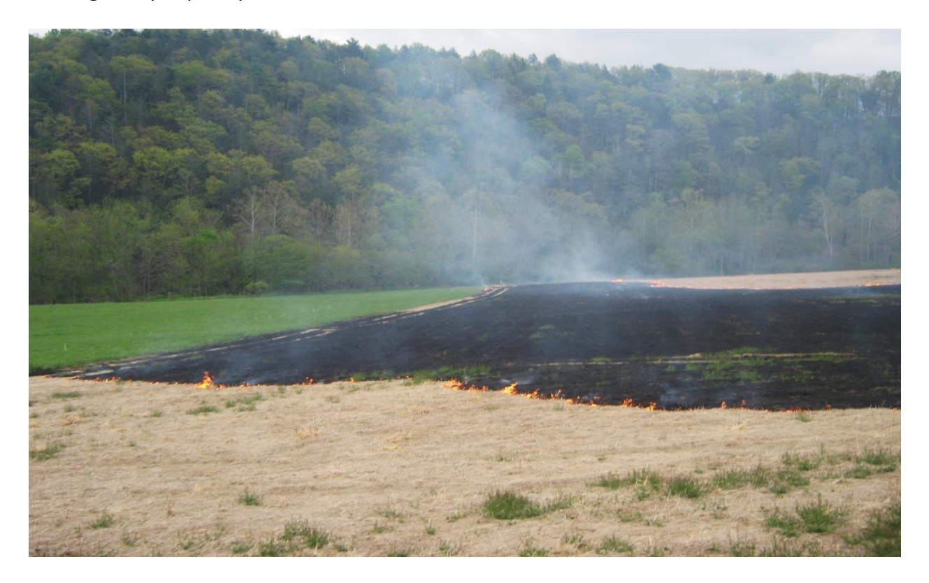
Spring burning can increase usable habitat

Depending on the vegetative cover native grasslands and CRP fields may be burned any time of the year, with the exception of during the spring and early summer nesting season. Land managers should apply fire to the landscape at different times of the year so that portions of fields and grasslands provide suitable cover throughout the year. Excessive burning all at once can negatively impact quail.