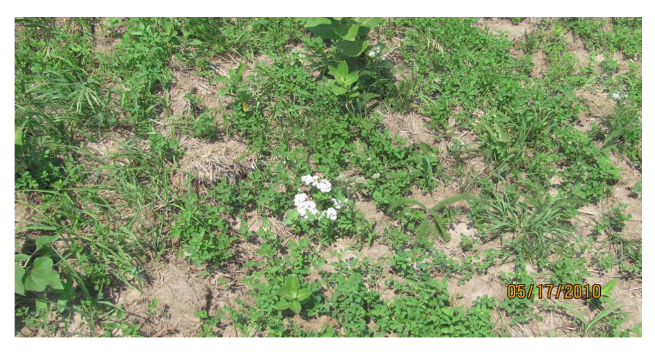
Interseeding used to increase forbs in a native grass stand

Herbicide Applications – Herbicides can be applied to rank stands of native grass to promote desirable forbs and legumes and to improve habitat structure. Selective or non-selective herbicides should be applied at labeled rates. Herbicide applications can be applied in strips 25 to 75 feet wide. Generally, no more than 1/3 of the area should be treated annually. Herbicide applications are most effective when combined with other management practices such as prescribed burning, strip disking and/or interseeding.