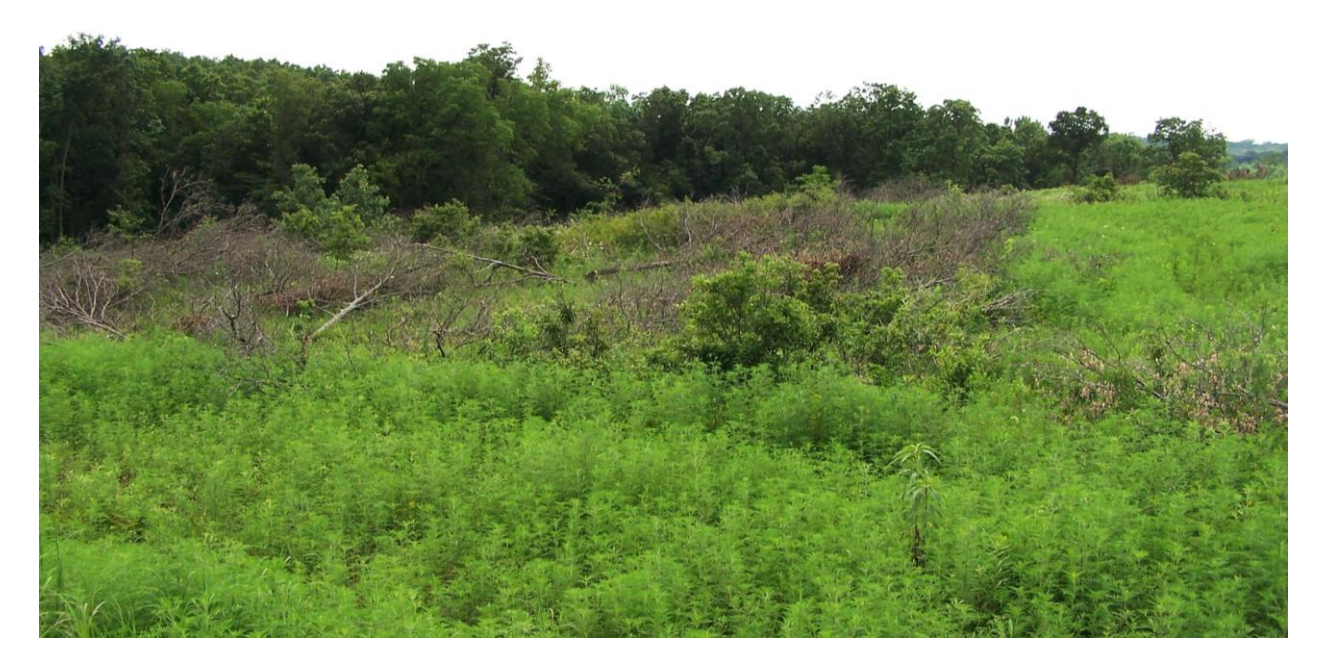
Edge feathering next to a disked area increases benefits

Shrubby Cover Enhancement – Winter coveys will often establish a headquarters area and loafing site around one or more shrub or low-growing woody cover sites. Patches of shrubby or woody cover should be spaced 50 to 100 yards apart and at least 30 to 50 feet wide. Native shrubs such as wild plum, shrub dogwood, blackberry and hazelnut make excellent shrubby cover. Shrubby cover should be fenced from livestock to avoid degrading this important cover type. Land managers should take advantage of continuous CRP marginal pastureland practices such as CP22 Riparian Forest Buffer and CP29 Marginal Pastureland Wildlife Habitat Buffer to establish favorable shrubby cover patches.