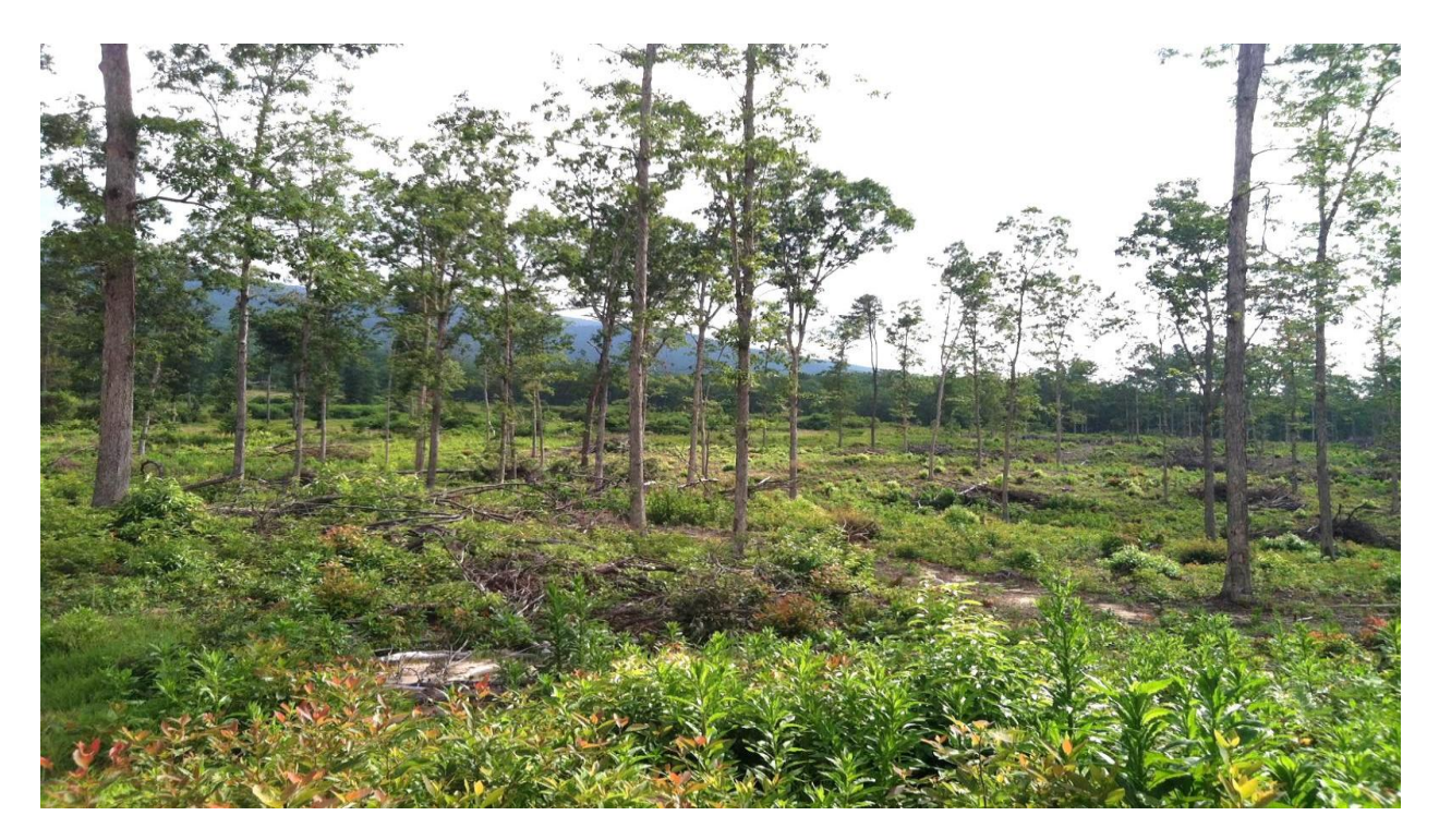
Recently heavily thinned woodland

Oak and Pine-Oak Woodland Thinning – A variety of silvicultural practices can be used to restore degraded oak and pine-oak woodlands. As a general rule of thumb, woodland sites should be thinned to between 20 and 50 square feet of basal area/acre to provide favorable habitat conditions for northern bobwhite. An open woodland canopy should be open enough