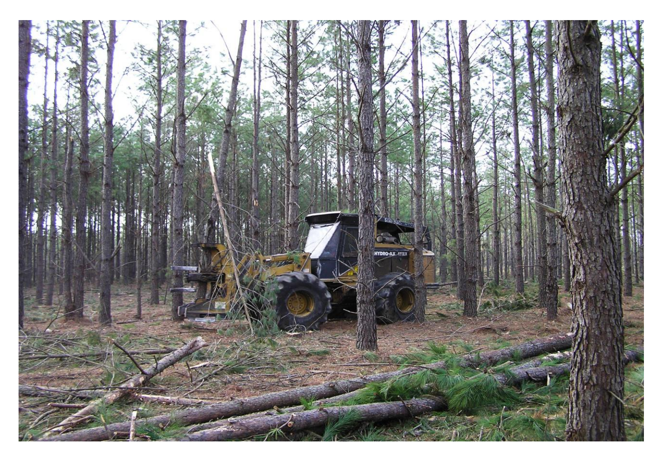
Logging operation