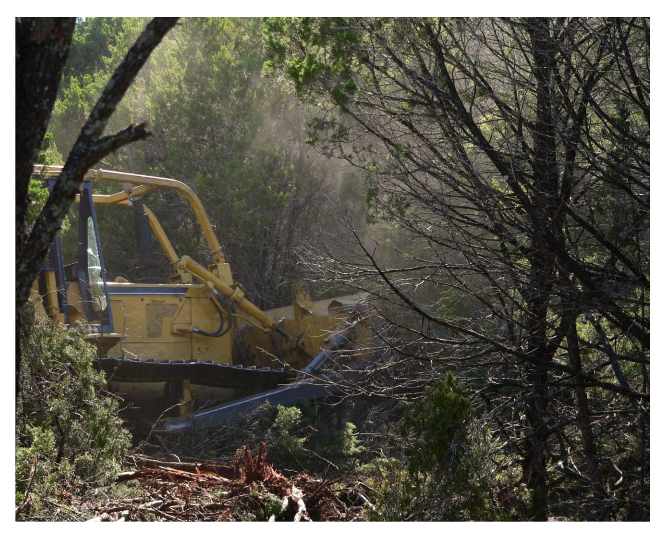
Controlling dense woody stands can get very expensive - photo by Chuck Kowaleski, TPWD

for reinvading plants or new colonies. Early detection and spot treatments are the most effective and economical means of controlling invasive vegetation.