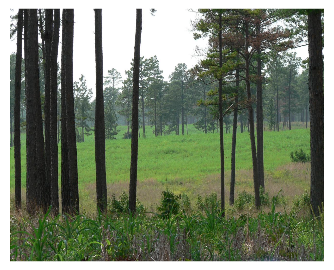
Well managed forest opening - Photo by Billy Dukes SCDNR

percent of the quail range should be in 3 to 5 acre fields that are evenly distributed throughout the woodland. As a rule of thumb, land managers should aim for one forest opening per 10 to 20 acres. When creating new forest openings, all marketable timber should be harvested from the site. After harvest, fields should be cleared with heavy machinery, making sure stumps and unmarketable timber are piled and burned.