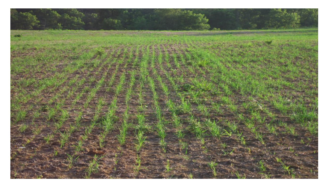
Sprayed twice and burned before planting

The key to establishing native grasses and wildflowers is to prepare a seedbed free of plant competition. Often multiple herbicide applications are necessary if sod forming grasses are present. If desirable native vegetation such as bunchgrasses and wildflowers are present consider managing the existing stand instead of establishing more native grasses. Remnant stands can be rescued by eradicating undesirable cool-season grasses with glyphosate in the fall after a killing frost or by applying selective herbicides during the growing season. Make sure to read and follow label directions when applying herbicides. It is difficult and expensive, if not impossible to salvage native vegetation on sites infested with exotic warm-season grasses.