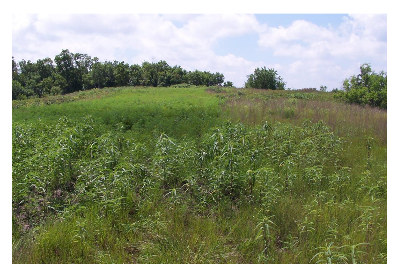
Fall strip disking encourages forb growth

Strip Disking (Wildlife Disking) – Fall or winter strip disking of planted or fallow field borders and idle corners creates a mosaic of disturbed and undisturbed areas. Once the field border is well established disturb 1/3 of the field border or idle areas each year. No more than 1/3 of the area should be disturbed annually since nesting cover is often a limiting factor in agricultural landscapes.