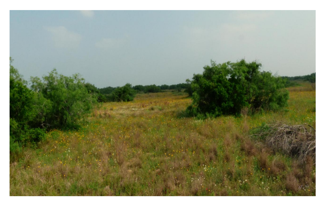
Selected brush removal combined with careful grazing

Land managers interested in enhancing quail habitat should fine tune brush control practices by selectively removing brush across the landscape while maintaining patches of protective woody cover. As a rule of thumb, patches of shrubby cover should be scattered across the landscape with no more than 50 yards between clumps. Species that provide good protective cover as well as seasonal food include sumac, dewberry, shin oak, wild plum, lotebush, sand sagebrush and mesquite. Care should be used in broadcast applications of herbicides for brush control. Many herbicides are nonselective and may eliminate broadleaf forbs critical for seed and insect production and desirable woody loafing and escape cover. Ideally herbicides should only be applied to the targeted invasive species. If that is not feasible consider applying herbicides in alternating strips or crosshatching (think tic-tac-toe) with untreated and partially treated areas left between the treated overlapping junctions.