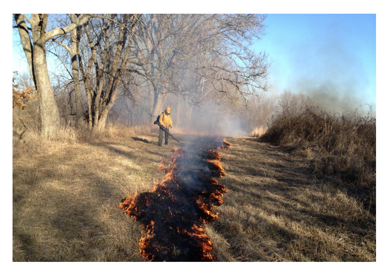
Prescribed burning benefits odd corners of habitat

Prescribed Burning – Should be used to maintain desired cover in field borders, buffers and idle corners. Prescribed burning helps stimulate quail-food plants and plant structure. As a general rule of thumb, no more than 1/3 of field borders or idle areas should be burned each year, especially in agricultural landscapes where nesting cover may be a limiting factor for quail. Depending on the vegetative cover field borders, buffers and idle areas may be burned any time of the year, with the exception of during the spring and early summer nesting season.