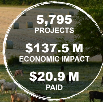
Tennessee Agricultural Enhancement Program