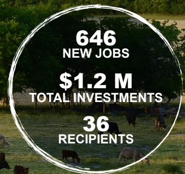
Agricultural Enterprise Fund