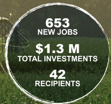
Agricultural Enterprise Fund