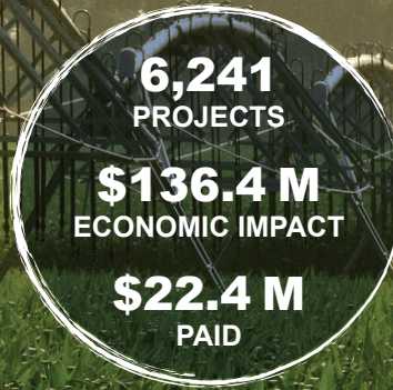
Tennessee Agricultural Enhancement Program