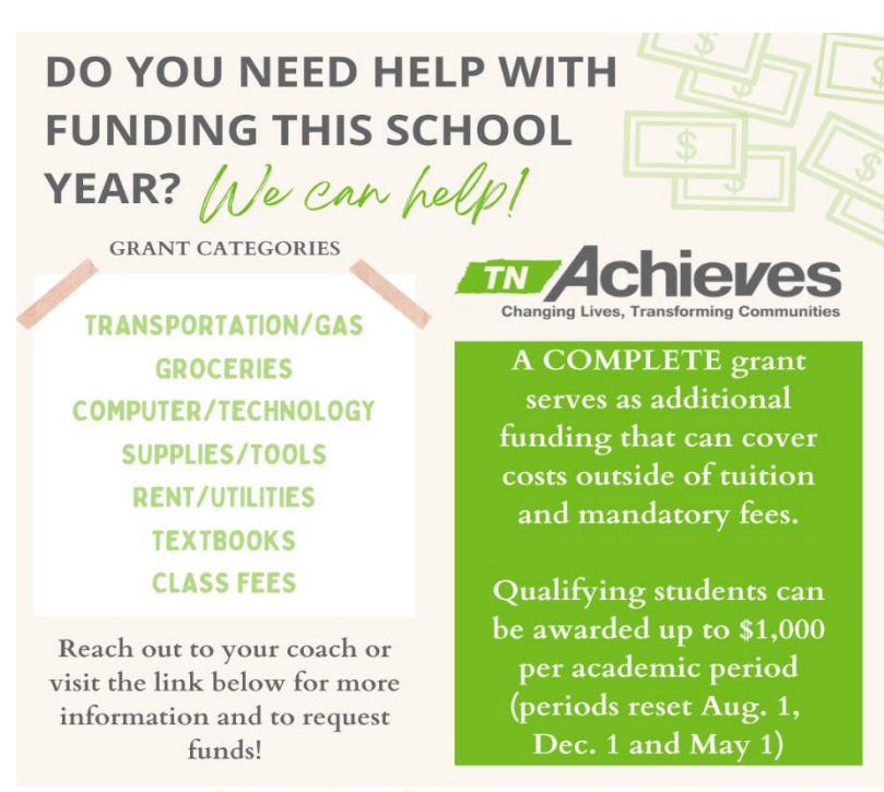
Figure 3: Sample Communication to Eligible Students, tnAchieves

In the first year, tnAchieves awarded all completion grant funds to needy students within the first 10 weeks of the semester. To receive funds, students completed the <u>tnAchieves completion grant application</u>, which notified coaches and initiated a connection. Coaches use the amount requested, the amount allowable based on the category, allowable funds remaining for the student, and in