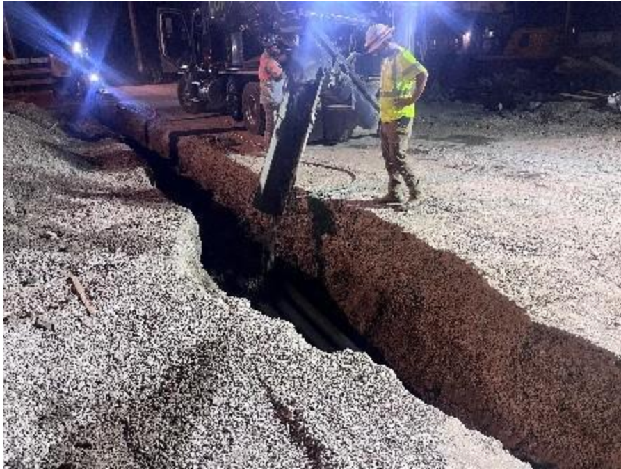
Installation of conduit for AT&T on Walton Ferry Road.