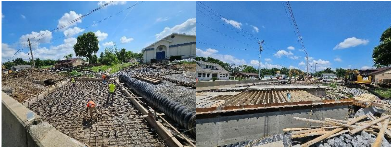
Box culverts on Old Shackle Island Road.