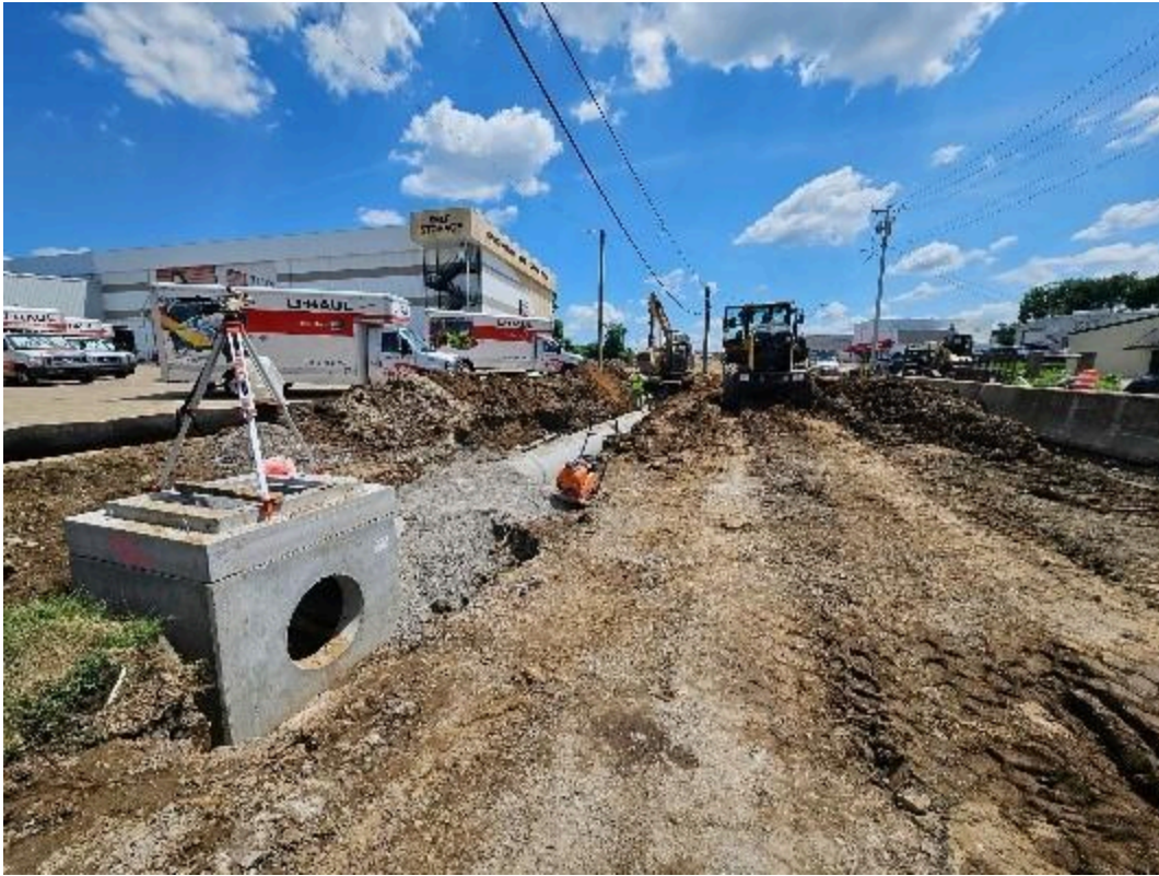
Installation of storm drain system on Old Shackle Island Road.