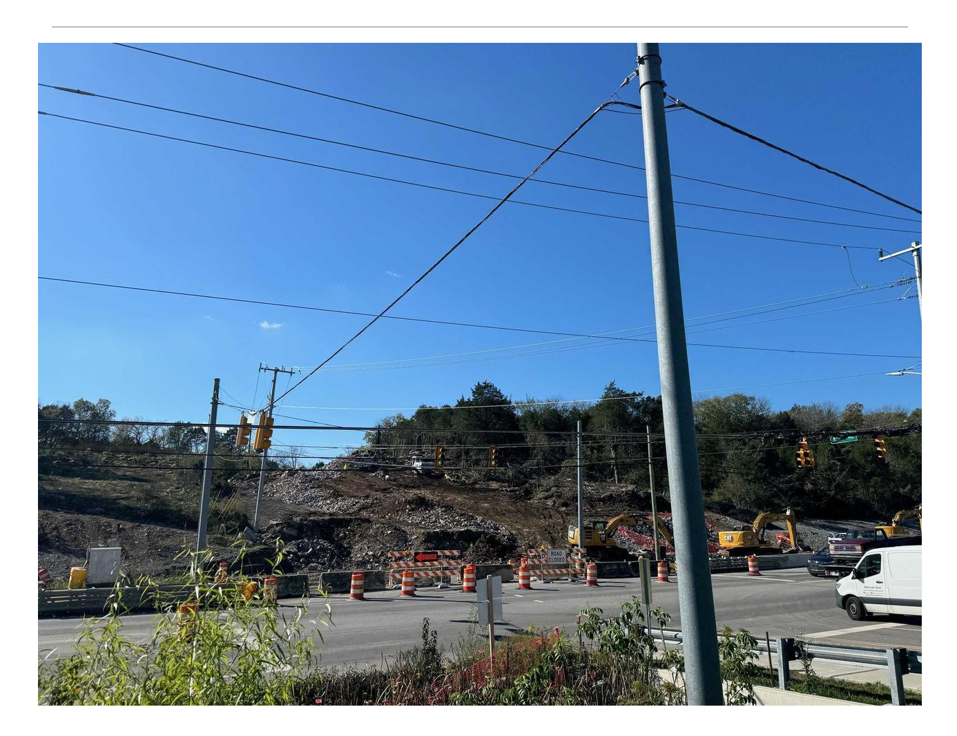
Visit Project Web Page