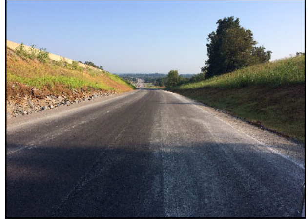
Detour Route at Bloodworth