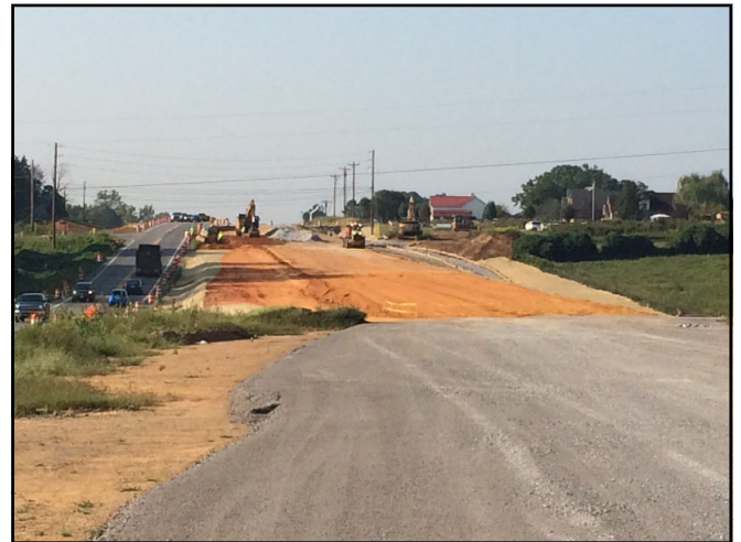
Grading Operations at Creighton Lane