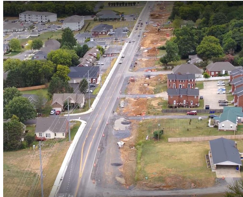
North of Cleveland Middle School; Greenfield Avenue