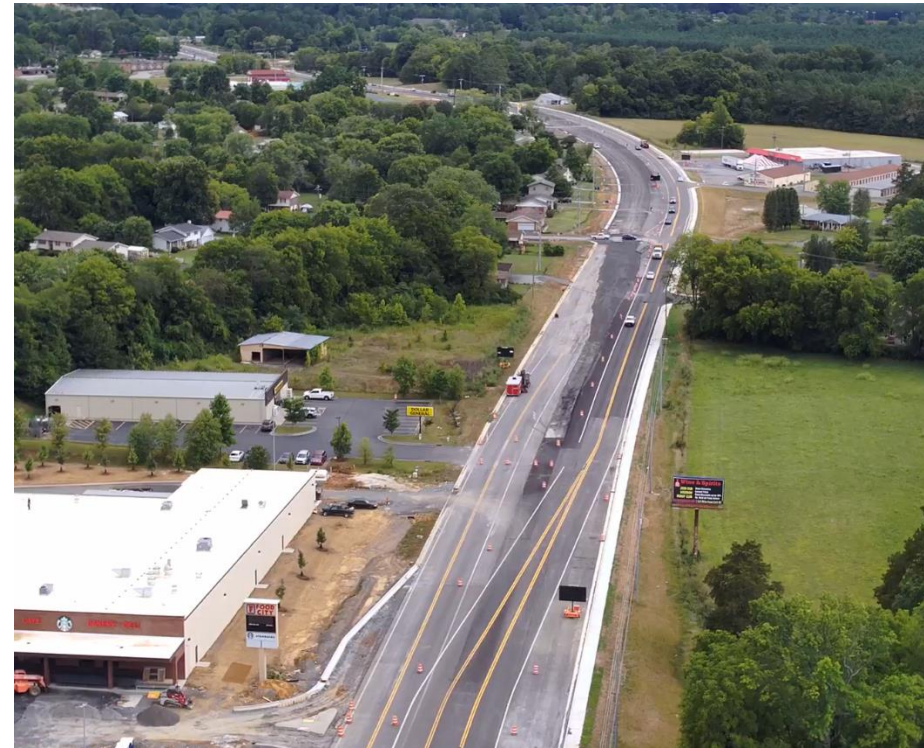
Dollar General/Food City near City Limits