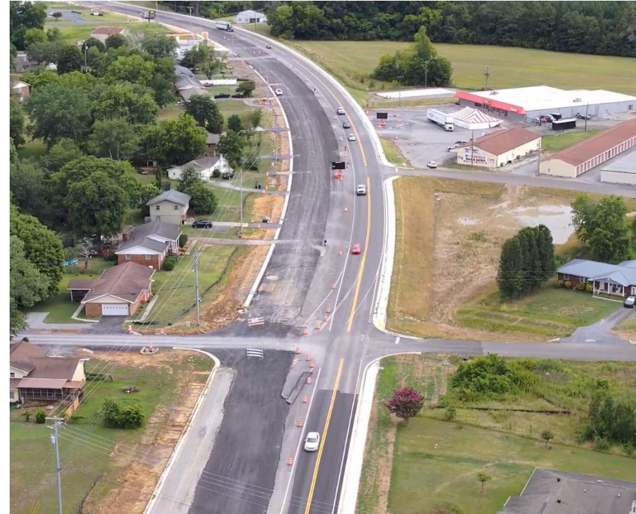
North of Dollar General near Ann Lane (Pond 2)