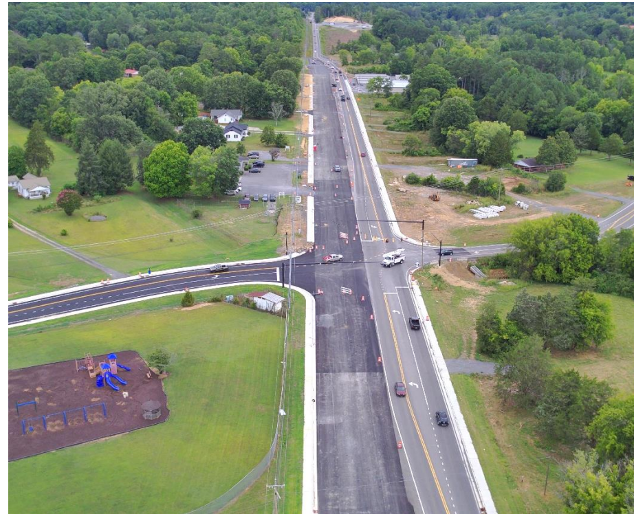
SR-306 (Eureka Road)/Freewill Road Intersection