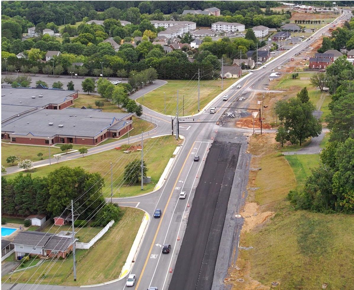
South of Cleveland Middle School; Eveningside Dr.