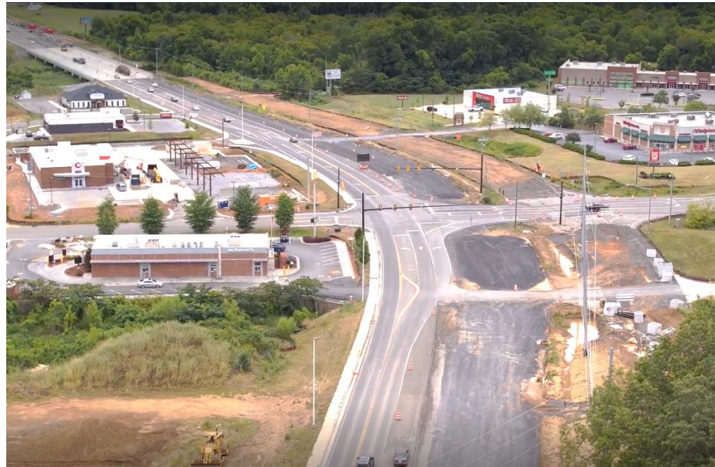
Paul Huff Parkway