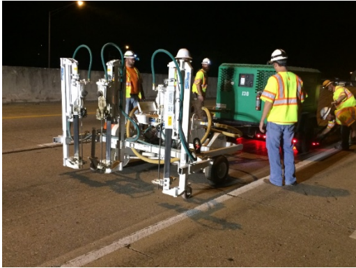
Figure 2 Drilling