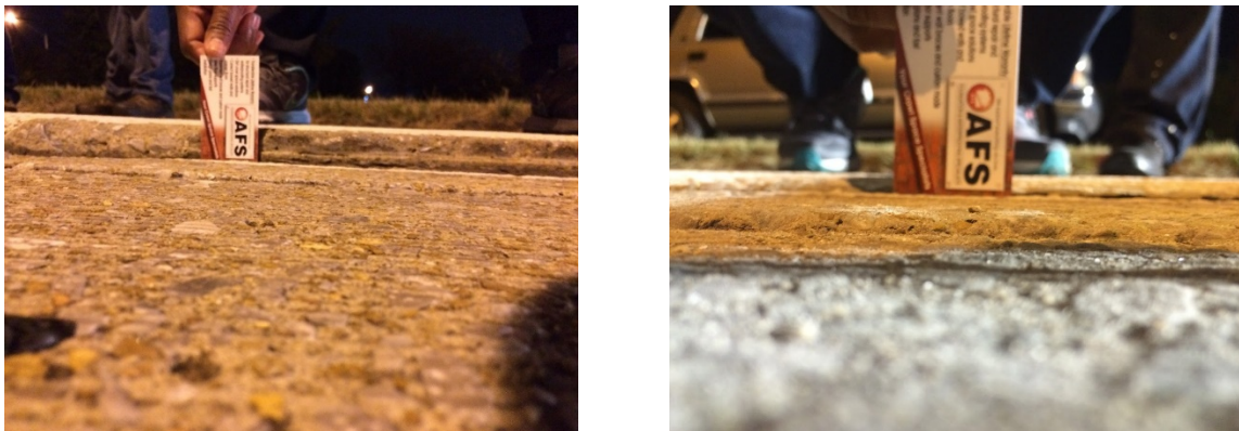
Figure 1. Left: Before PolyLEVEL application, right after PolyLEVEL application

Six sites on I-24 and I-75 in Chattanooga TN (TDOT Region 2) are being monitored after being levelled using PolyLEVEL material. Figure 1 below shows the installation of poly level on I-24 Westbound mile marker 179.5 to 178.2. Some slabs here were raised from 1.25 in to less than 0.25 in.