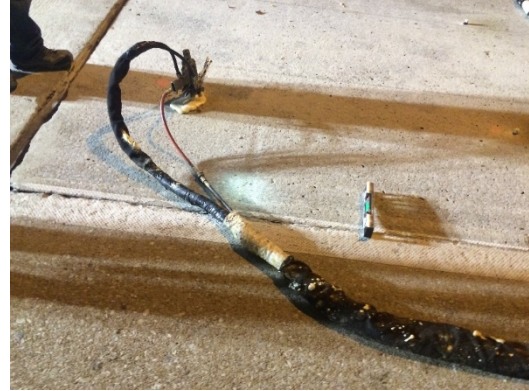
Figure 3 PolyLEVEL Injection

Figures 2 and 3 shows hole-drilling on rigid pavement and injection of PolyLEVEL through the drilled holes. Holes are sealed after the completion of PolyLEVEL injection.