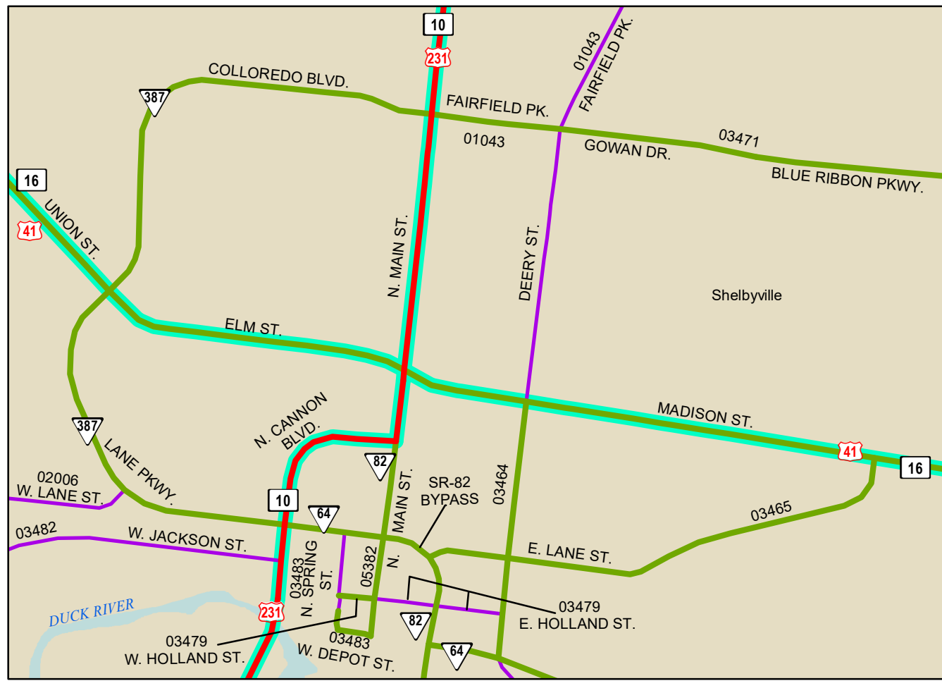
INSET NO. 1