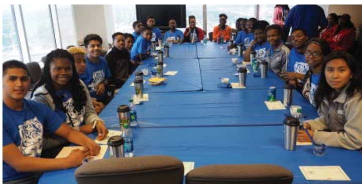
2014 NSTI Students