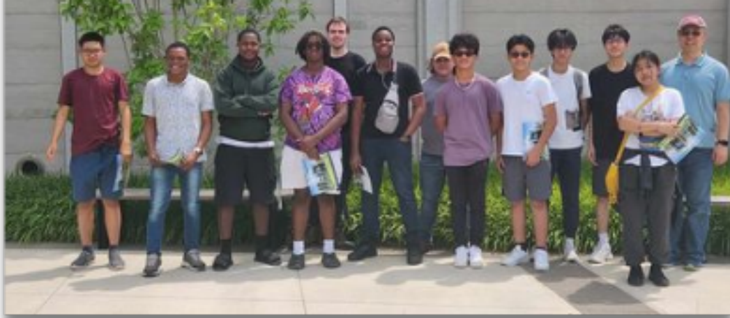
2024 NSTI Students, MTSU Counselors, and Program Director