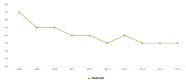
Teens Ages 16 To 19 Not In School And Not High School Graduates (Percent) - 2008-2017

National KIDS COUNT KIDS COUNT Data Center, datacenter.kidscount.org A project of the Annie E. Casey Foundation