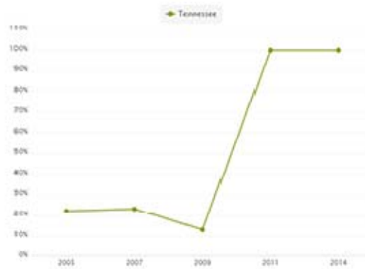
Confirmed Child Abuse Cases Receiving Post-Investigation Services

Note: Non-consecutive years appear adjacent in the trend line because one or more years have been deselected.