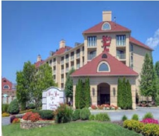
Music Road Inn and Conference Center 314 Henderson Chapel Road, Pigeon Forge, TN 37863

Individuals wishing to reserve a hotel room for the 2013 TIBRS conference may do so now. The Music Road Inn and Conference Center in Pigeon Forge, TN is currently accepting hotel room reservations for TIBRS conference attendees. Hotel reservations for the 2013 conference may be made online or by telephone.