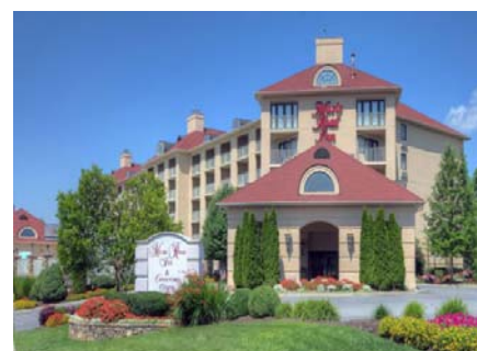
Music Road Inn and Conference Center 314 Henderson Chapel Road, Pigeon Forge, TN