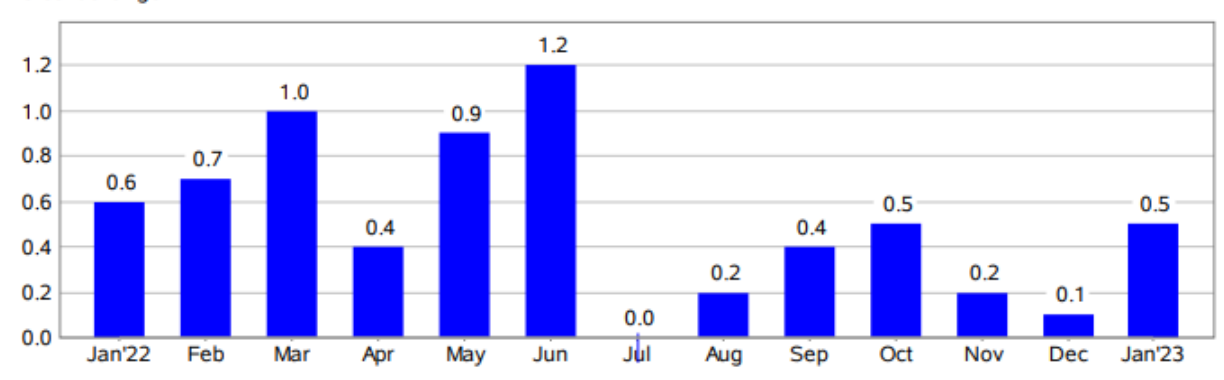
Chart 1. One-month percent change in CPI for All Urban Consumers (CPI-U), seasonally adjusted, Jan. 2022 - Jan. 2023 Percent change

Tuesday, <u>Consumer Price Index</u>: "The Consumer Price Index for All Urban Consumers (CPI-U) rose 0.5 percent in January on a seasonally adjusted basis, after increasing 0.1 percent in December.... Over the last 12 months, the all items index increased 6.4 percent before seasonal adjustment.... The index for shelter was by far the largest contributor to the monthly all items increase, accounting for nearly half of the monthly all items increase, with the indexes for food, gasoline, and natural gas also contributing."