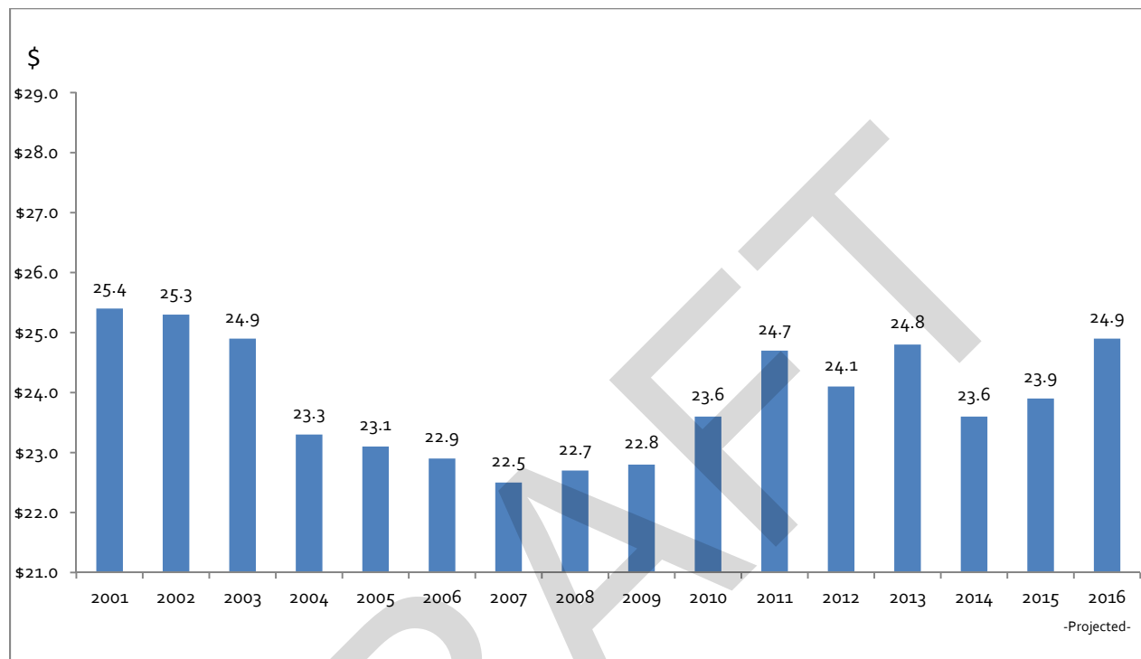
Figure 1. Tennessee Valley Authority Statutory Debt at Year End (in billions)