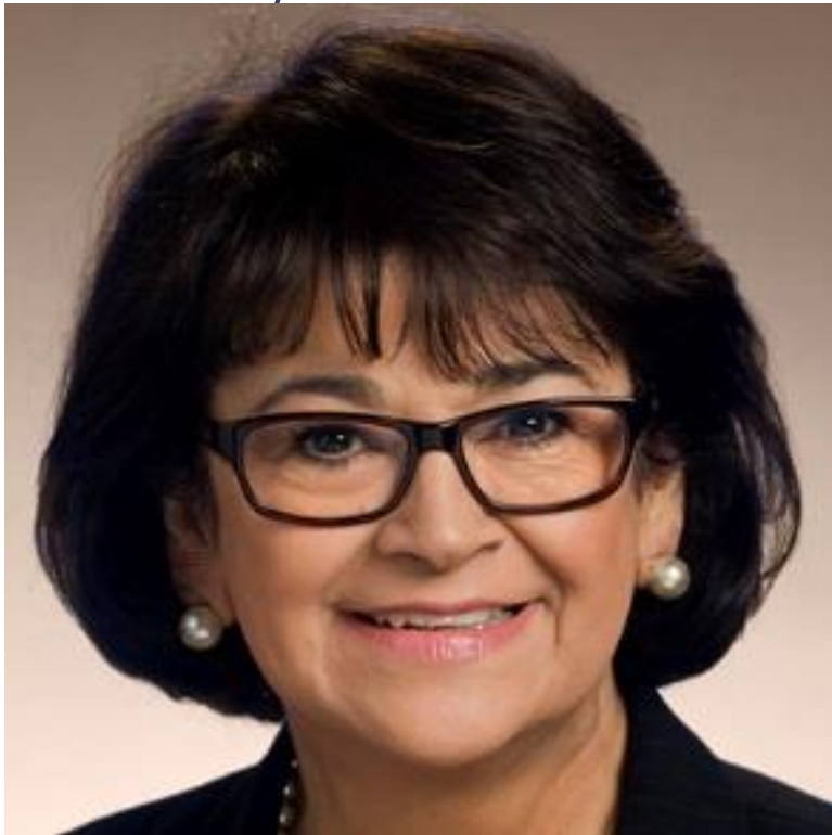
SEN. DOLORES GRESHAM (R-FAYETTE)