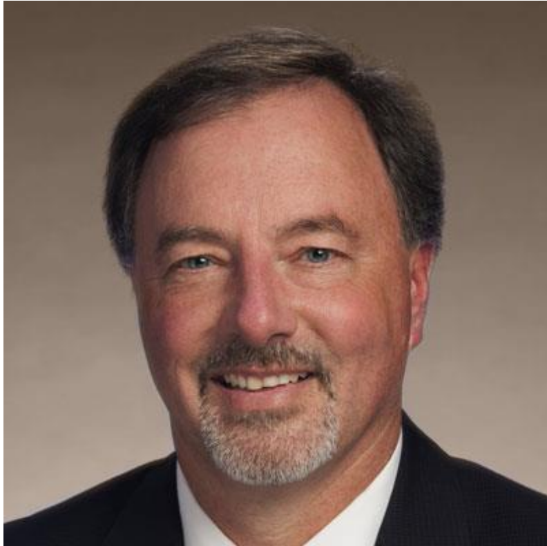
SEN. MIKE BELL (R-BRADLEY)