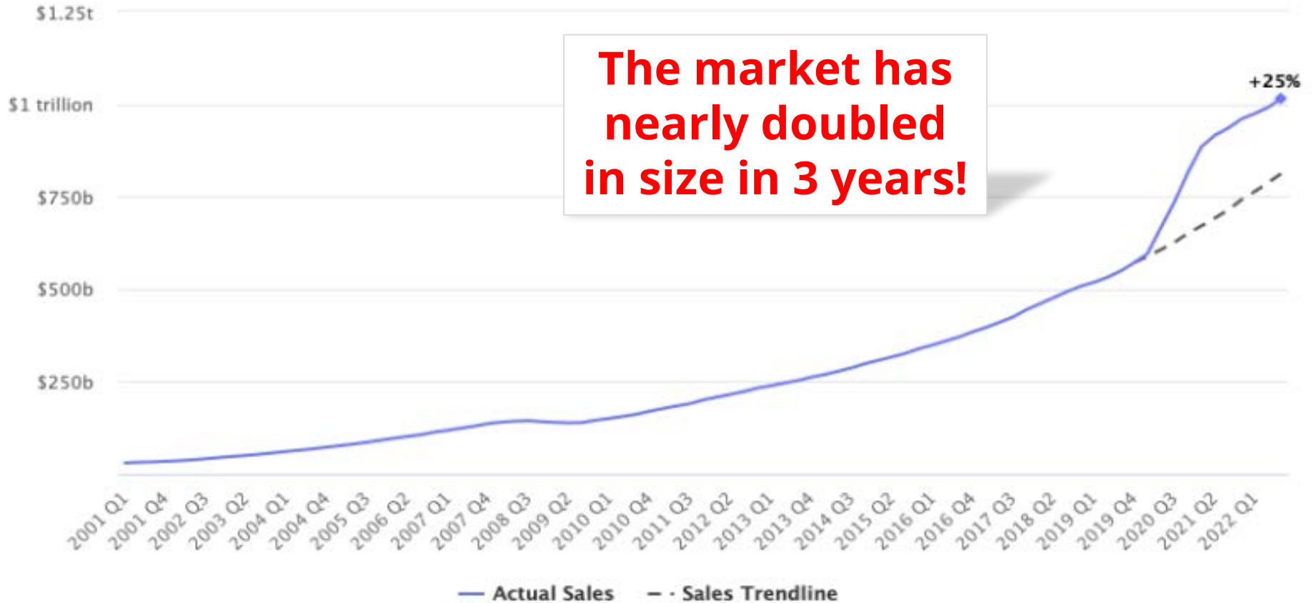
U.S. E-Commerce vs. Trendline