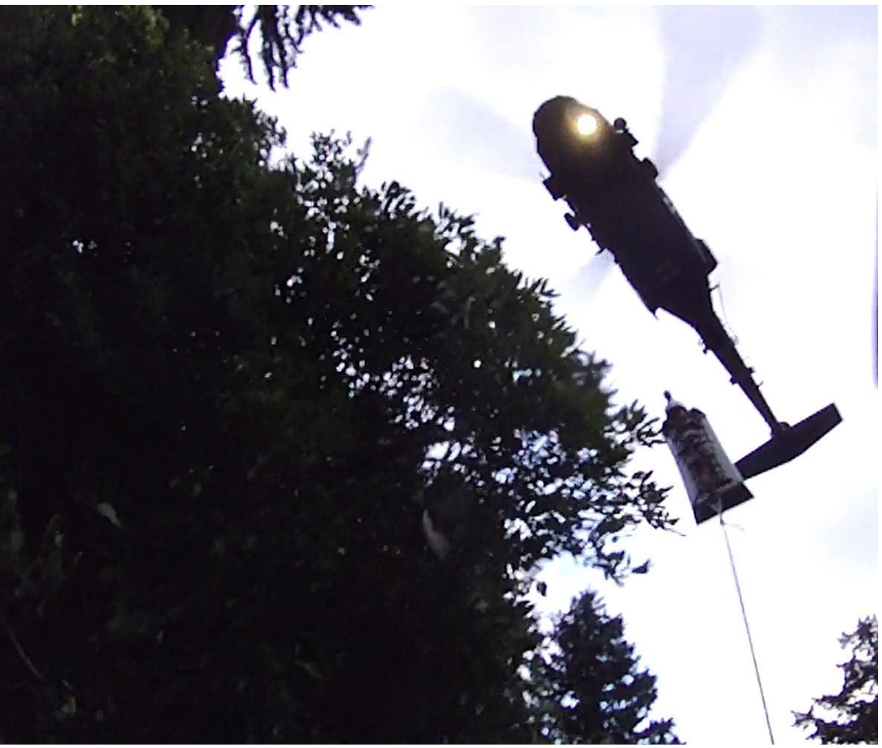
An injured hiker, who is immobilized and protected on a Skedco stretcher, is hoisted into a hovering Tennessee Army National Guard Blackhawk helicopter during a rescue at the Great Smoky Mountains National Park, July 27. (Submitted photo)

All Tennessee Army and Air National Guard press releases can be found at <u>https://www.tn.gov/military/news.html</u>