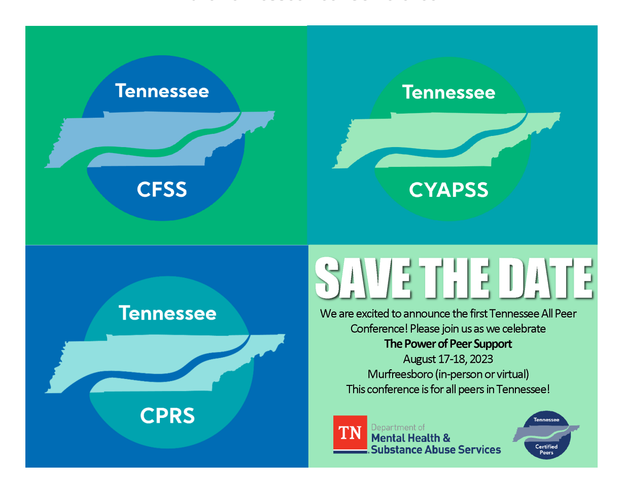
2023 Tennessee Peer Conference

TDMHSAS is committed to providing individuals with disabilities an equal opportunity to participate in and benefit from TDMHSAS programs, activities, and services. To request reasonable accommodations or modifications, please contact Amy Holland at <a href="mailto:amy.holland@tn.gov">amy.holland@tn.gov</a> at least 10 business days prior to the meeting. Requests for accommodations or modifications made after the deadline will be honored to the maximum extent feasible, but it may not be possible to fulfill them.