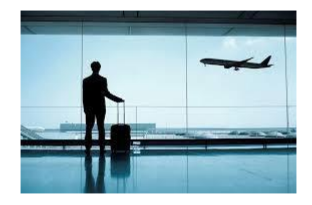
Travel expenses due to distance between parents