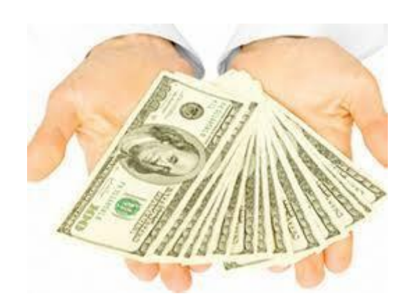
Available Income or statutory threshold