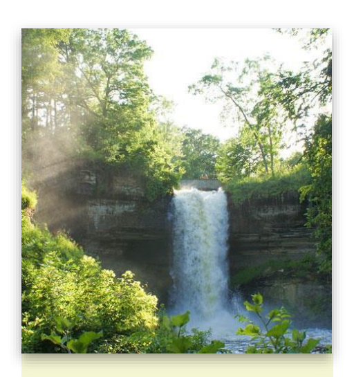
Exclude benefits received from any means-tested public assistance programs.