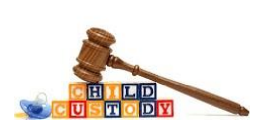
Child in Legal Custody