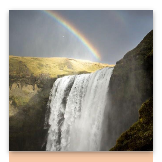
Means tested benefits include: