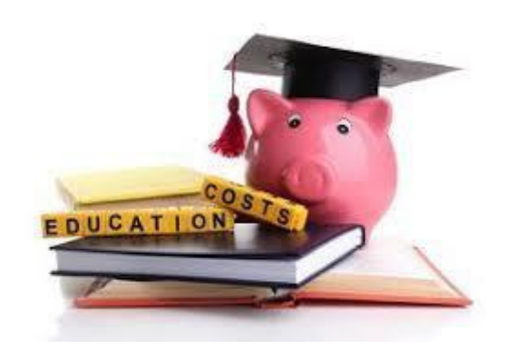
Extraordinary Educational Expenses