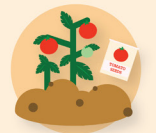
Plants & Seeds