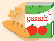
Cereal & Bread