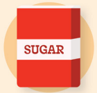
Single-ingredient sugars used for cooking and baking