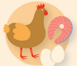
Poultry Meat & Fish