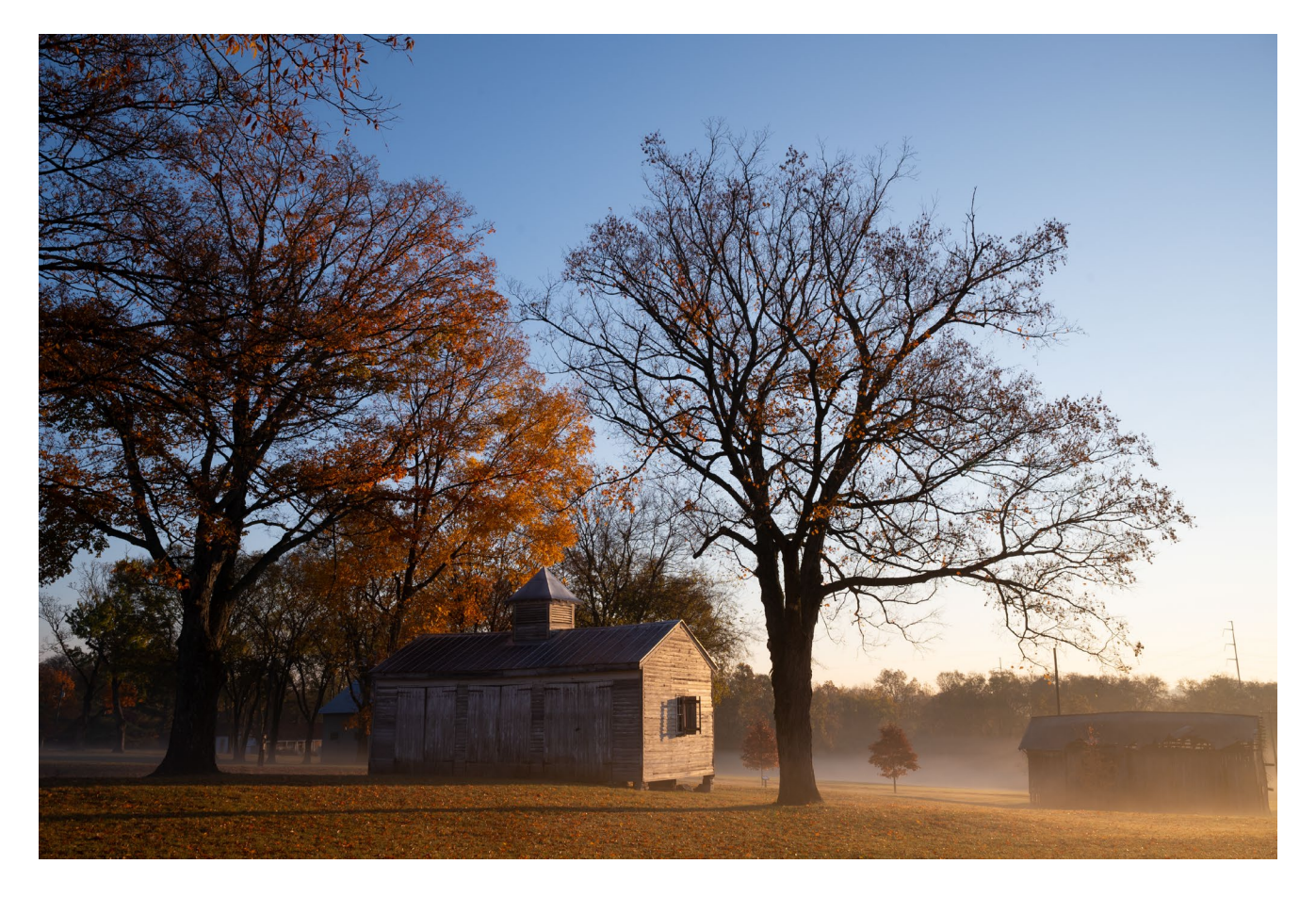
Clover Bottom Mansion, THC Headquarters