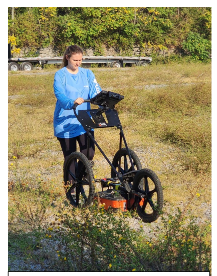
Vanderbilt Graduate Student Conducting GPR at Fort Negley

The Battle of Nashville was the culminating event of the Civil War in the West that was both the final destruction of the Confederate Army of Tennessee and the last major engagement of the American Civil War in the Western Theater. Despite the historical significance of this event, newer, cutting-edge historical and archaeological tools such as comprehensive geographic information system (GIS) analysis, georeferenced historic maps, high-resolution digital scanning, landscape modelling,