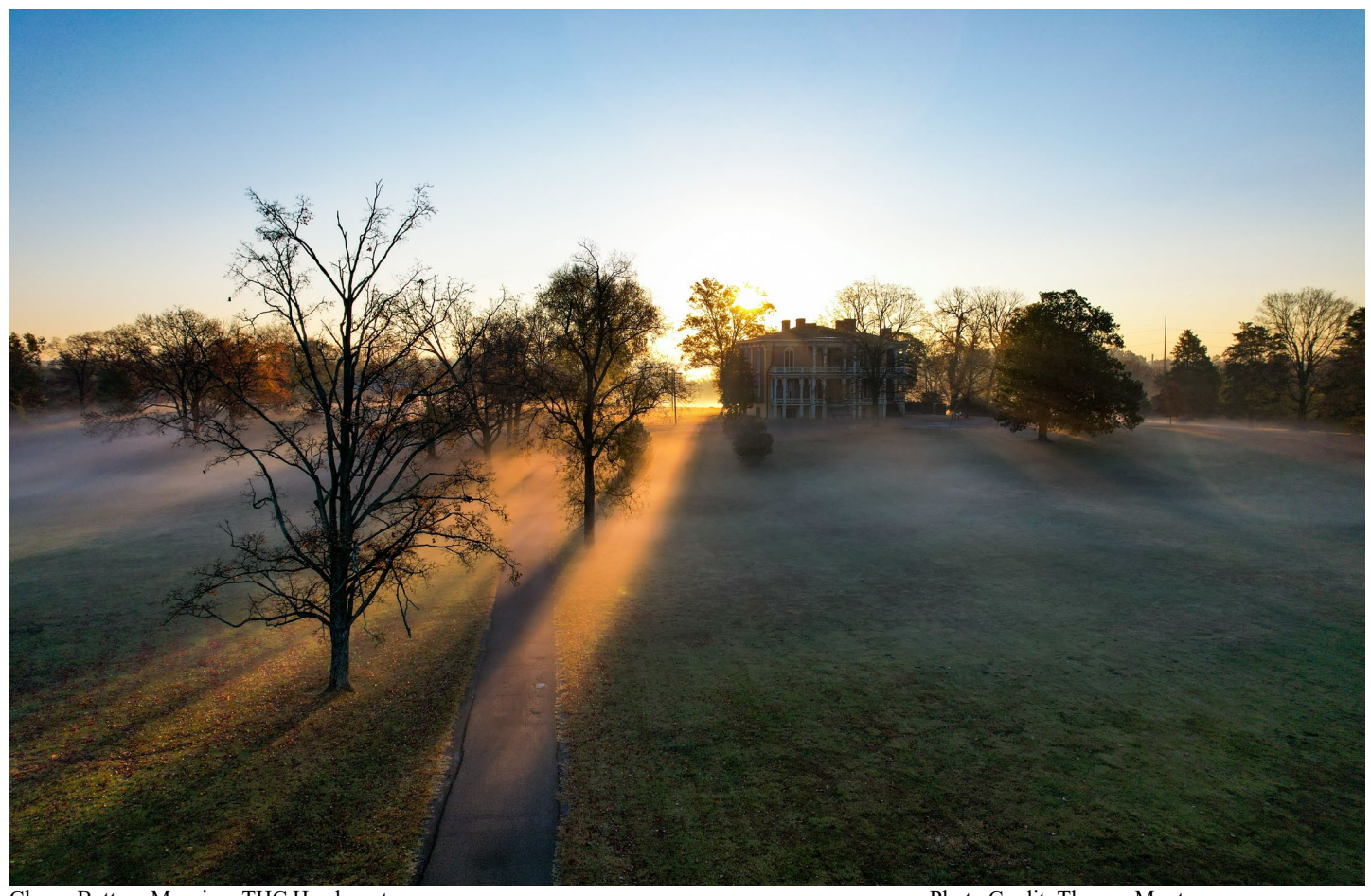
Clover Bottom Mansion, THC Headquarters