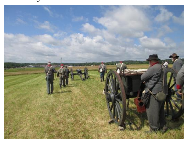
Reenactors at Parkers Crossroads work to attach a cannon to a limber for transport.

A limber is a two-wheeled cart designed to support the trail of an artillery piece or the stock of a field carriage such as a caisson or traveling forge, allowing it to be towed. The limber was typically pulled by four to six horses and contained one chest. It was attached to a cannon or a caisson that featured two chests and a spare wheel. When the artillery piece was in action, its limber was stored at the rear of the firing line. When the ammunition from the ammunition chest on the piece's limber was