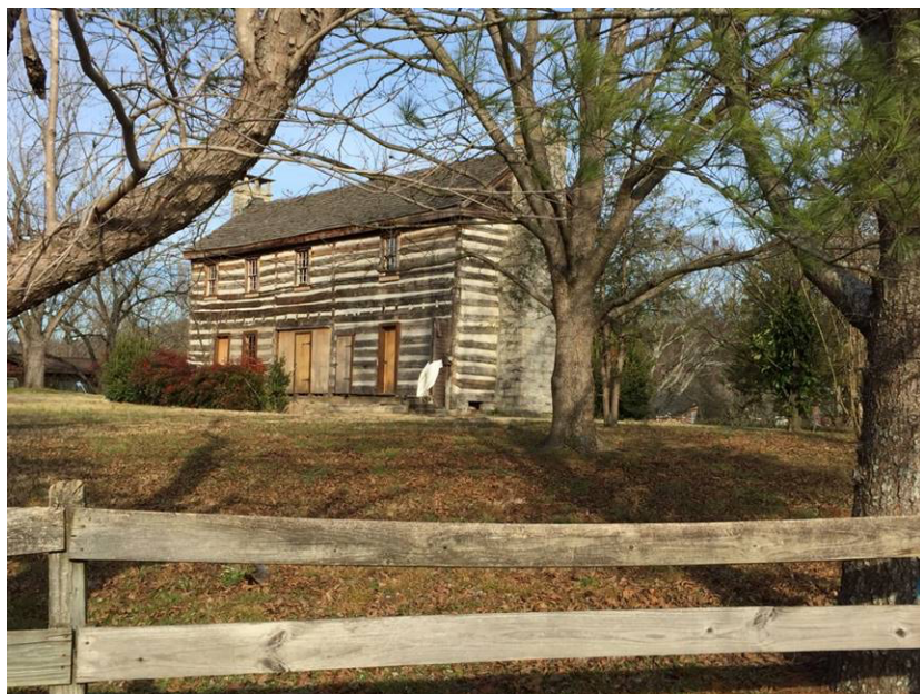
Ca. 1803 Brown's Tavern on the Chapin Tract

The Civil War Sites Preservation Fund provides matching funds for the acquisition and preservation of Civil War battlefields. Properties must be associated with the 38 most significant Civil War sites in Tennessee, as defined by the National Park Service (NPS). Funds can also assist in the acquisition and protection of Underground Railroad sites eligible for listing on the National Register of Historic Places, or eligible for designation as a National Historic Landmark. Applicants must be a 501(c)(3).