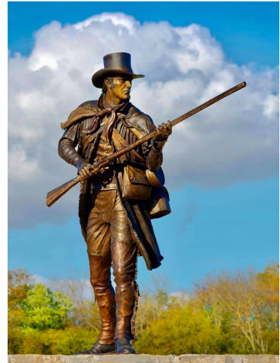
Tennessee Volunteer Statue at Camp Blount

2. Camp Blount Historic Site Association, Lincoln County, was awarded $25,000.00 to complete Phase II of fabrication for the “Tennessee Volunteer” statue. Phase II encompassed the creation of the mold, casting of the statue in bronze, transportation to and installation at the site. In the 2018 fiscal year, the Wars Commission awarded $40,000.00 towards Phase I for the development of the “Tennessee Volunteer” statue.