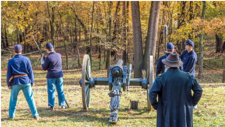
Johnsonville State Historic Park’s Artillery Firing Demonstration

4. Johnsonville State Historic Park, Humphreys County, was awarded $11,500.00 to strengthen their current living history artillery and infantry firing demonstrations by purchasing one 10 pound Parrot artillery piece, which was part of the Federal defense of Johnsonville during the Civil War, and by purchasing one reproduction 1861 Springfield Musket.