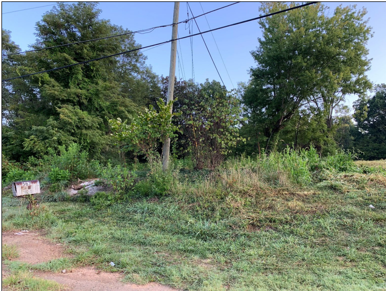
Figure 3: Former Site of the Moses Looney Fort House. This image shows the same area as shown on the left side of the February 2024 google streetview image in Figure 1.