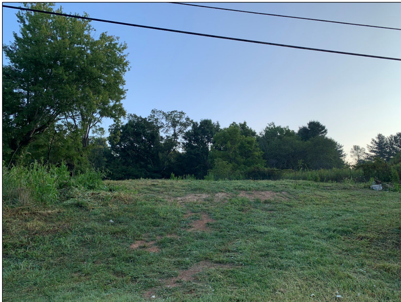
Figure 2: Former Site of the Moses Looney Fort House, August 23, 2024. This image shows the same area as shown on the right side of the February 2024 google streetview image in Figure 1.