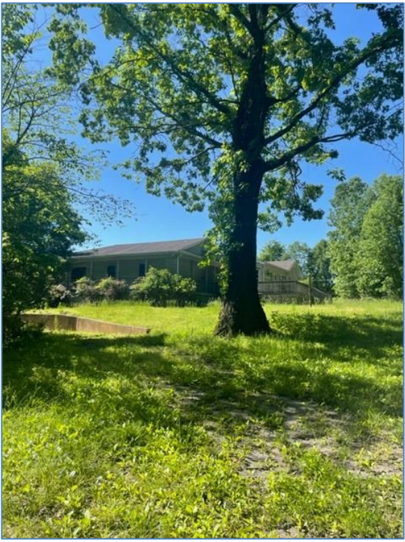
Figure 2. House and Gravel Drive northeast of John Garrett Cemetery.