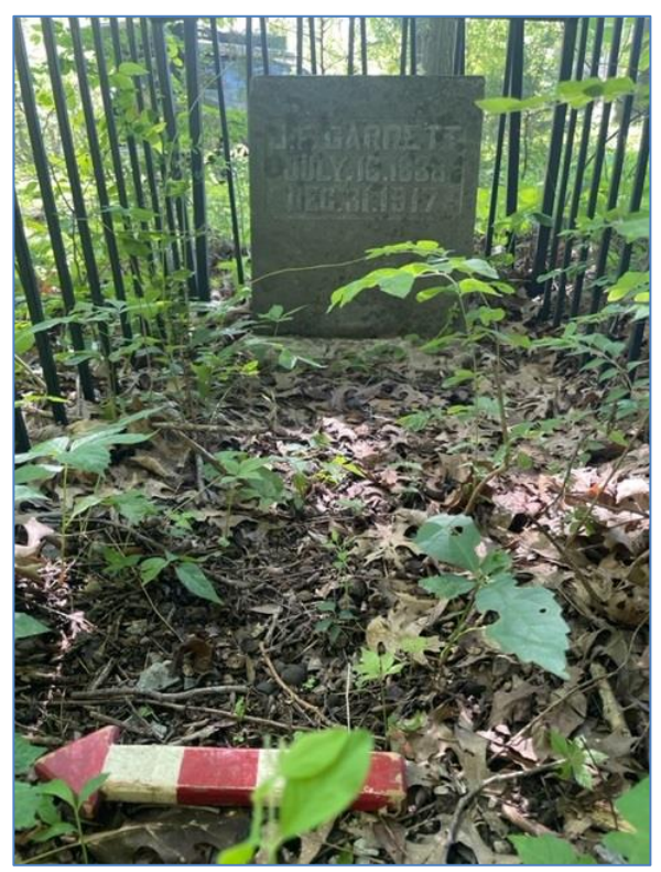
Figure 5. Inscription on the John Garrett Headstone.