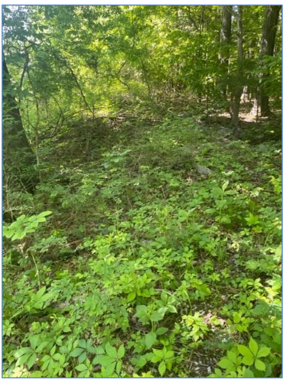
Figure 4. Push pile directly west of John Garrett Cemetery.