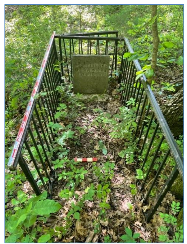
Figure 3. John Garrett Cemetery.