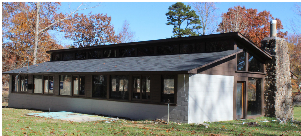
Highlander Folk School Library.