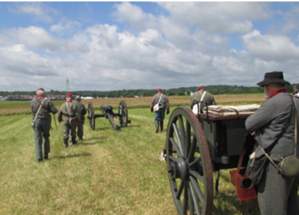
Reenactors at Parkers Crossroads work to attach a cannon to a limber for transport.