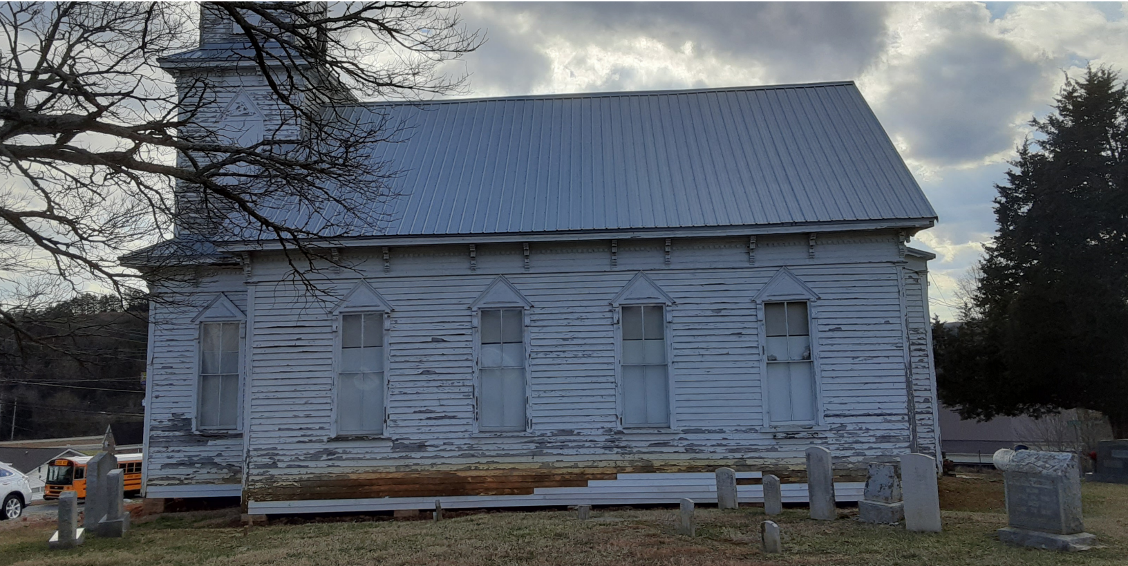
Blue Springs Church, Greene County

$30,000 to for electrical work and gutter restoration of the National Register-listed Dunbar Rosenwald School.