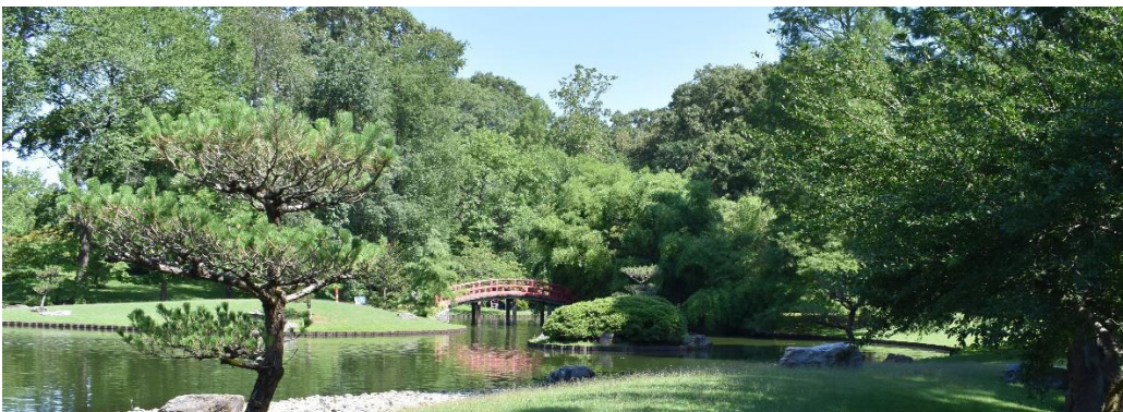
Audubon Park Historic District.

Audubon Park Historic District is important for both its history and its landscape