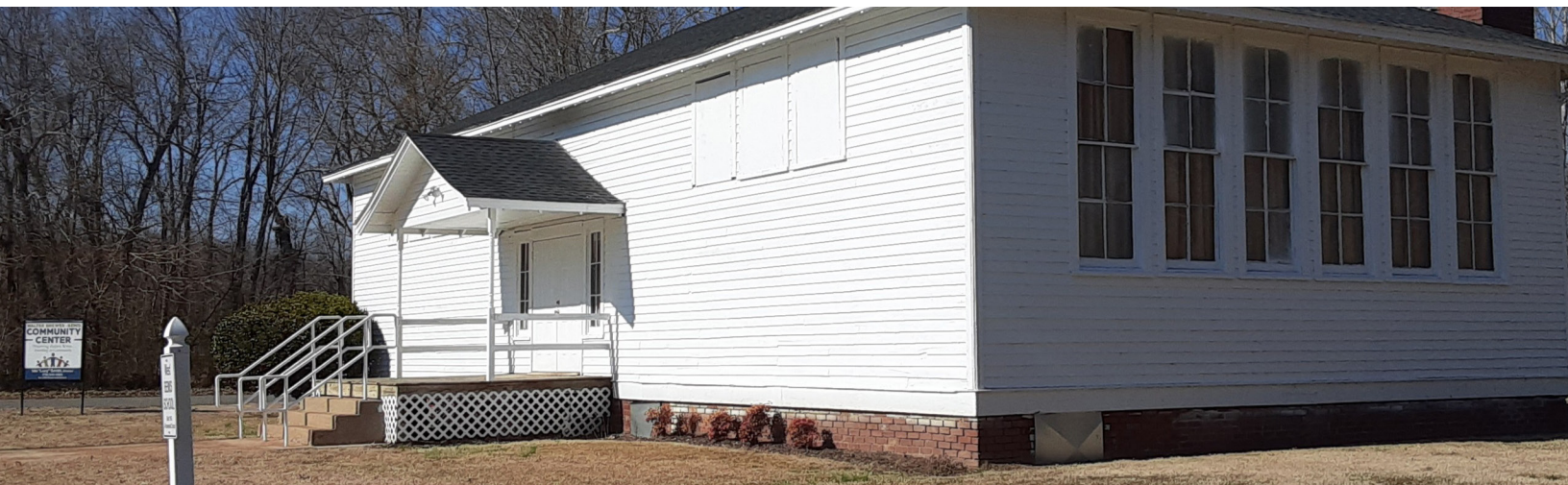
Former Bemis Rosenwald School, currently Walter Brewer Bemis Community Center, Bemis, Madison County

$35,000 to fund a preservation specialist staff position for the Upper Cumberland Development District.