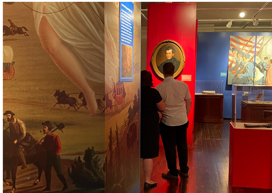
"Shaping a Nation: Tennessee Volunteers and the Mexican American War" 2022 exhibit at Columbia's James K. Polk Home.

1. The American Battlefield Trust (ABT) was awarded $50,000.00 to create The Road to Freedom Project which will feature both a brochure and map as well as a mobile application that explores Tennessee historic sites across 24 counties associated with the Black experience during the Civil War era. This project will enable visitors to experience the power of place and uncover compelling stories of strife, growth, and community by surfacing concepts of empowerment and self-empowerment. Locations featured in the project will range from Civil War Trails interpretative signs and historic highway markers to museums, cemeteries, and battlefields with permanent installations related to Black history. This interactive experience will elevate the visitor experience, making these sites come alive by introducing voices of the past in the places that shaped American History.