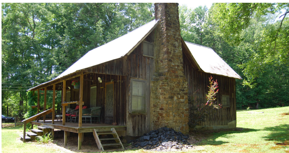
Akins house.

The Cemetery School is located on Mount Olive Road in the historically African American community of Cemetery, north of the Stones River National Cemetery and Battlefield in Murfreesboro, Rutherford County. Cemetery is a post-Emancipation rural community whose foundation is intimately connected to the Stones