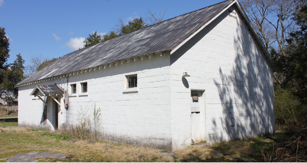
Cemetery School. Photo Courtesy of Savannah Grandey Knies, 2022.

River National Cemetery. Like other African American communities across Tennessee, Cemetery had to provide for the educational, religious, and cultural needs of its members because of Jim Crow segregation laws and threats of white violence. The nominated school building was constructed in 1941 by the National Youth Administration and replaced an earlier school built in 1874. In addition to educating the youth of Cemetery, the school also hosted community events such as singings, retirement parties, and celebrations of life. The last students attended Cemetery School in 1962, and in 1963 the school was consolidated with the all-black Smyrna Rosenwald School. The current owner is a relative and descendant of Cemetery community members and continues to maintain the property for future generations.