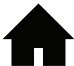
Health + Built Environment