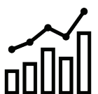
Evaluation + Assessment