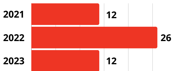
Number of TN Emergency Department Visits Involving Tianeptine by Year [2021-2023]

Source: TN Syndromic Surveillance (ESSENCE)