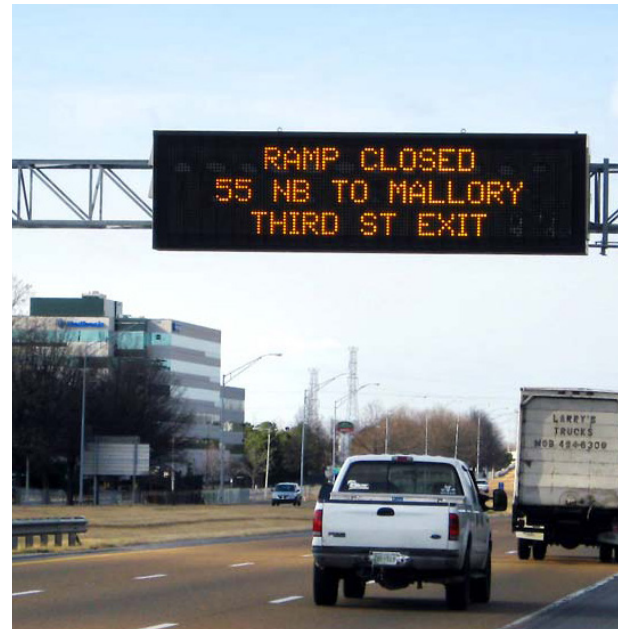
TDOT Interstate Dynamic Message Sign