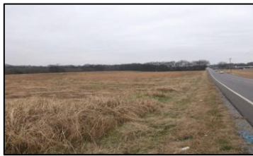
Frontage on Hwy. 11