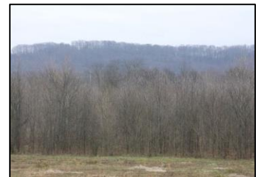
Partial view of Flood Zone