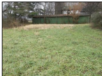
Old Home Site