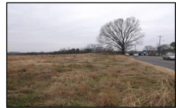
View from Wal-Mart