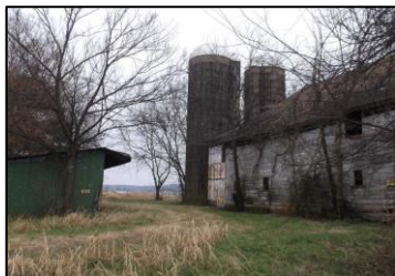
Old Farm Buildings