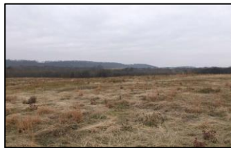
View facing South