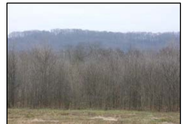
Partial view of Flood Zone