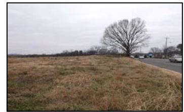
View from Wal-Mart