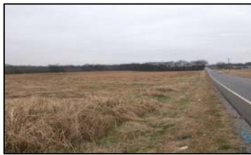
Frontage on Hwy. 11