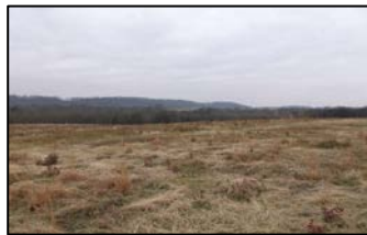
View facing South