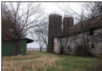
Old Farm Buildings