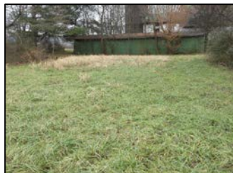
Old Home Site