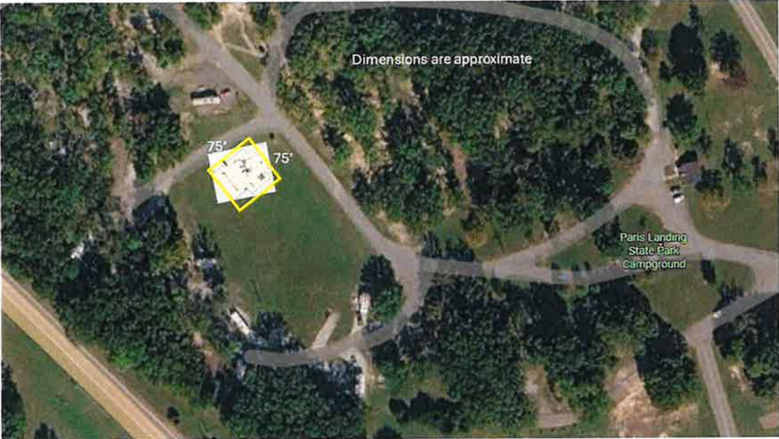
Aerial view of proposed playground location (dimensions approximate)

Access via campground loop road. No designated staging area; coordination required. Drainage ditch along western boundary may limit access and staging options.