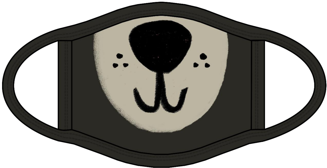
Design Image #2