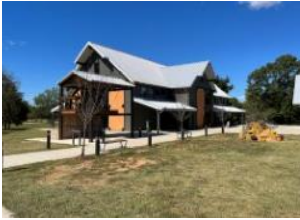
Existing Visitor's Center