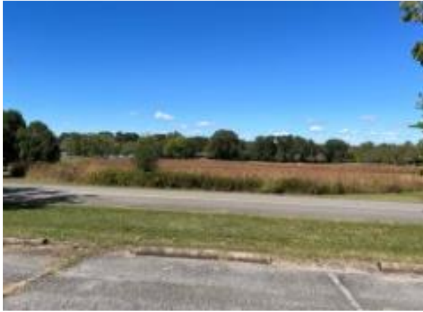
Site Area View North to Native Grassland