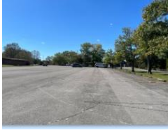
Parking Area north of existing pool view west