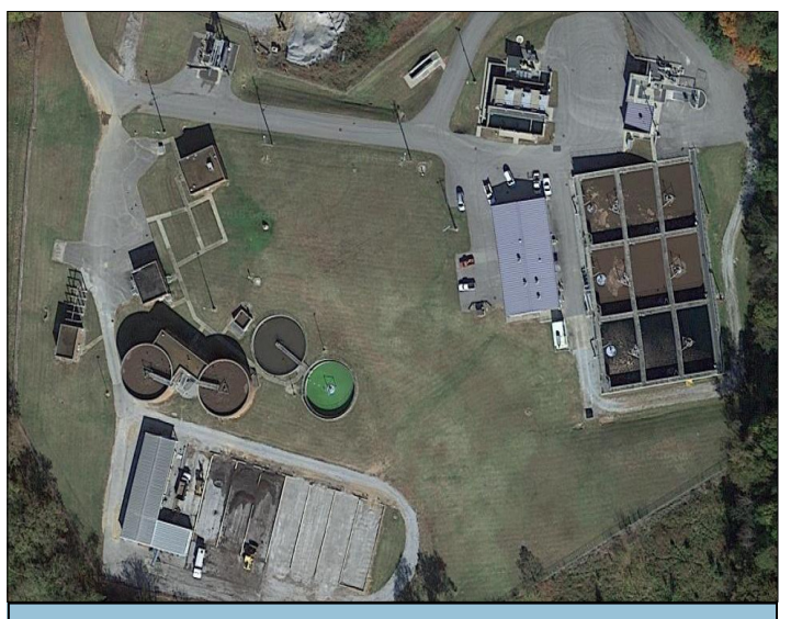
Lawrenceburg Wastewater Treatment Plant

Lawrenceburg, a city of approximately 10,000, is set on Shoal Creek, just 15 miles north of the Alabama state line. The plant is designed to treat 4.5 million gallons per day (mgd), and currently treats about 1.5 mgd of municipal wastewater. It uses three sequencing batch reactors (SBR) aerated with up to two 350-HP centrifugal blowers. Biosolids generated during treatment are processed in aerobic digesters fed by two 40-HP blowers.