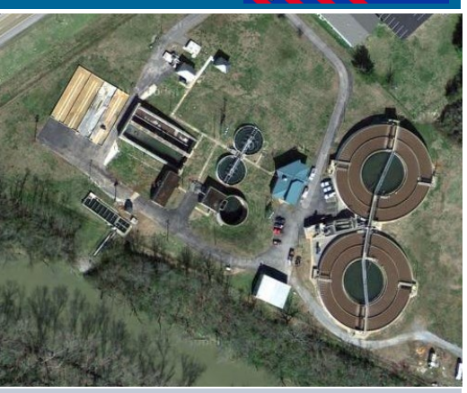
Fayetteville Wastewater Treatment Plant

Fayetteville has utilized their energy savings to invest in additional equipment at the WWTP that will allow additional energy savings in the future. Luminescent Dissolved Oxygen (LDO) probes have been installed in the aeration basins and are being connected to the WWTP control system to give real-time monitoring of the oxygen levels and allow better control of the aerators and blowers. The plant management continues to implement energy savings measures including changing to one-ditch operation for half the year and lowering the