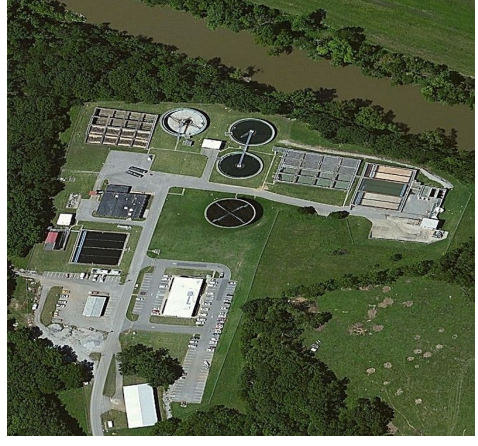
Columbia Wastewater Treatment Plant

The Columbia Wastewater Treatment Plant (WWTP) was expanded and upgraded in 2000 to a 14 mgd design flow, 28 mgd peak flow, with fine screens and grit