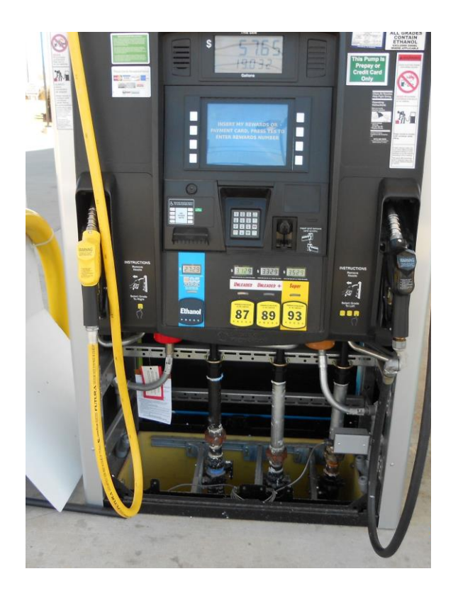
Please remember to empty fuel/water/debris from your dispenser sump and manage wastes properly.

https://www.tn.gov/environment/programareas/sbeap-small-business-environmentalassistance.html