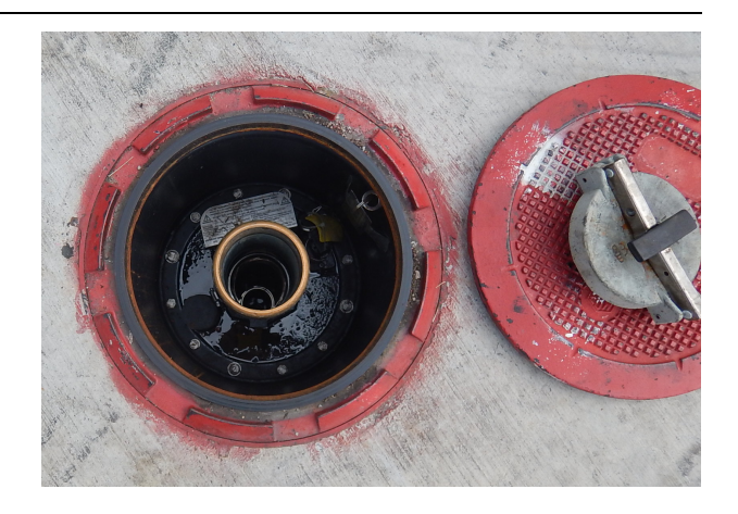
Please remember to empty fuel/water/debris from your spill bucket and manage wastes properly.

https://www.tn.gov/environment/ program-areas/ust-underground-storagetanks/forms-guidance.html