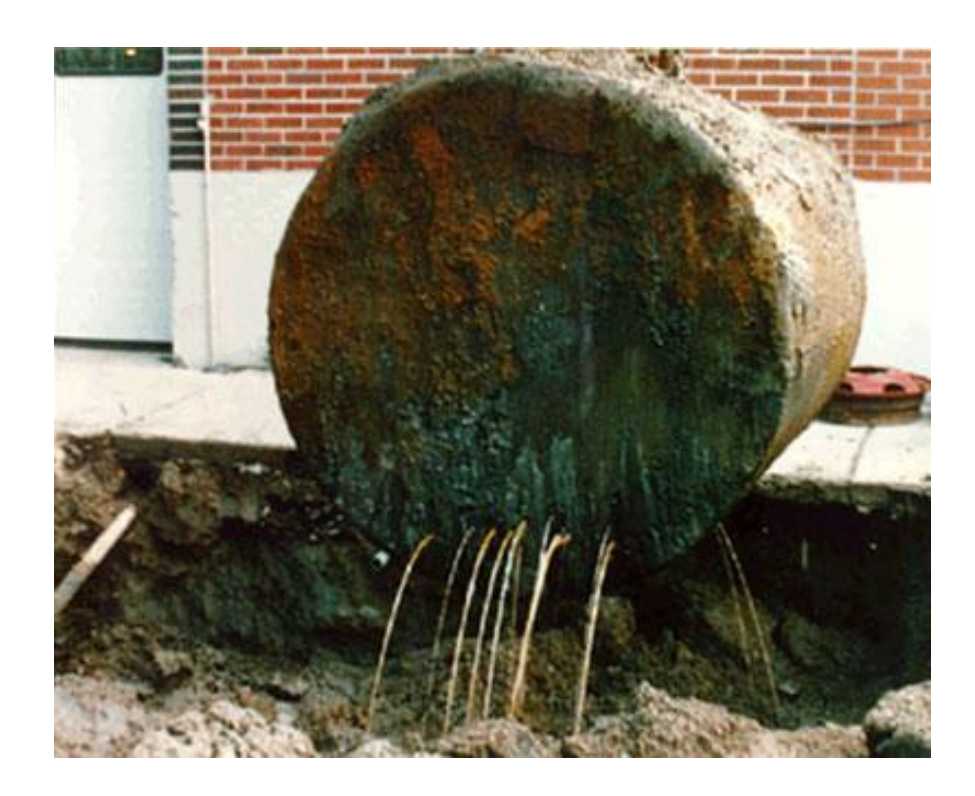
Without proper corrosion protection, you may have a product release.