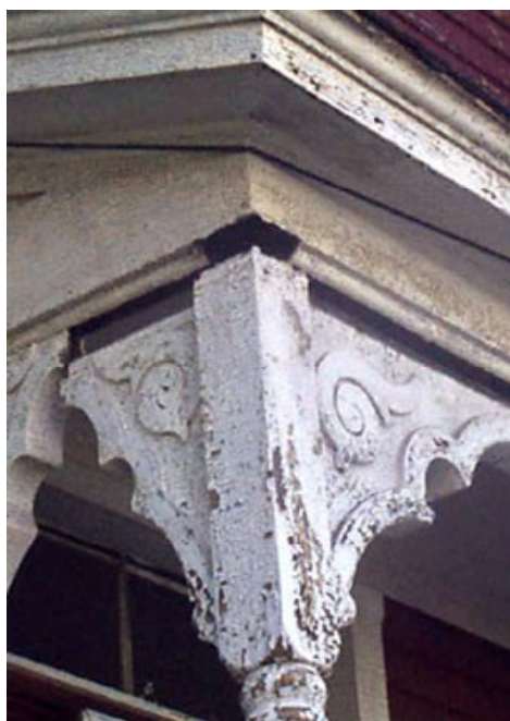
FIGURE 1.2 Deteriorated residential paint on house trim.