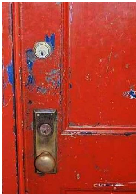
FIGURE 1.3 Paint deterioration.

Because the greatest risk of paint deterioration is in dwellings built before 1950, older housing generally commands a higher priority for lead hazard controls (see Figures 1.2 and 1.3). (See Chapter 5 for lead-based paint prevalence data by building component type and prevalence of housing with significant lead-based paint hazards by year of construction.)